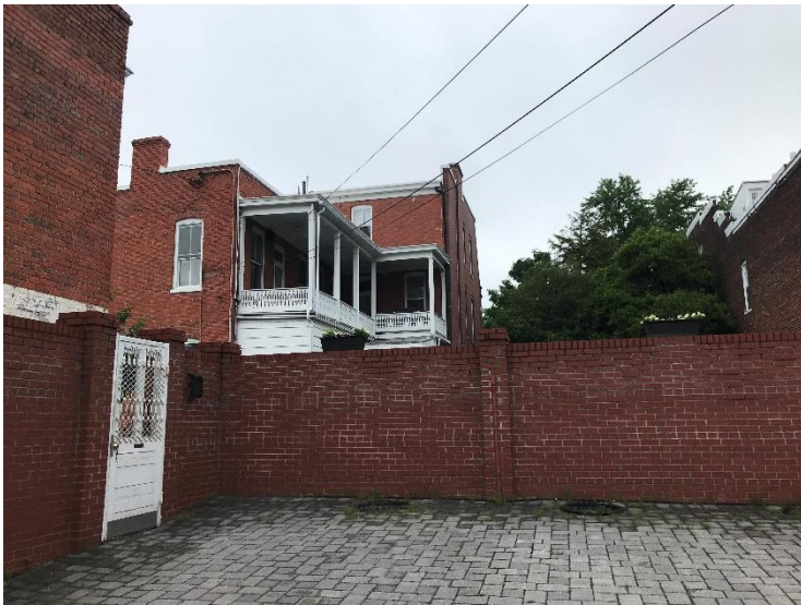
Figure 1. Rear porch