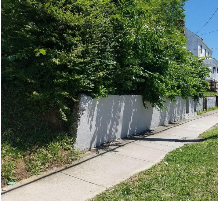
Figure 1. 815 Mosby Street, wall.