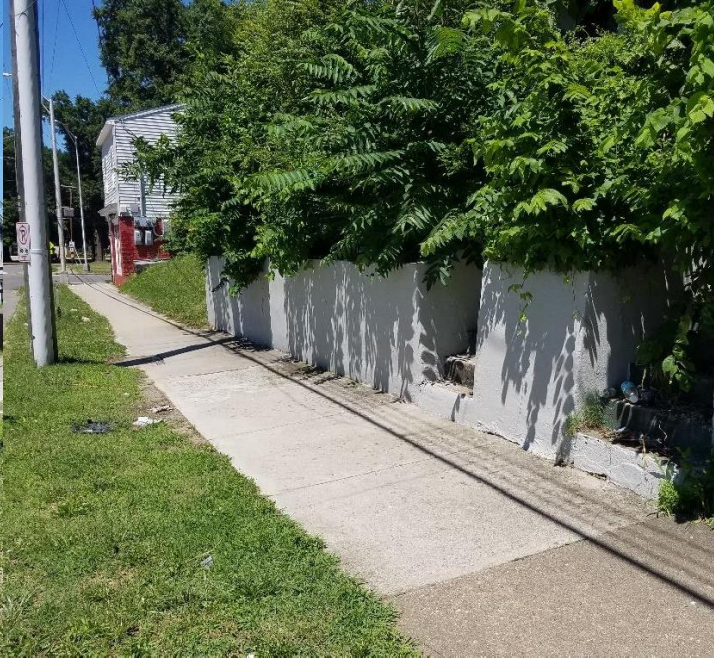
Figure 2. 815 Mosby Street, wall.