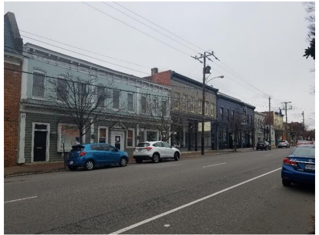
Figure 4. West Main Street, odd side looking west