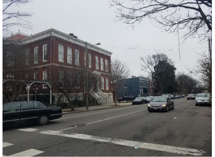
Figure 2. West Main Street, even side, looking east