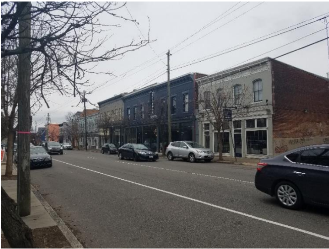
Figure 3. West Main Street, odd side, looking southeast