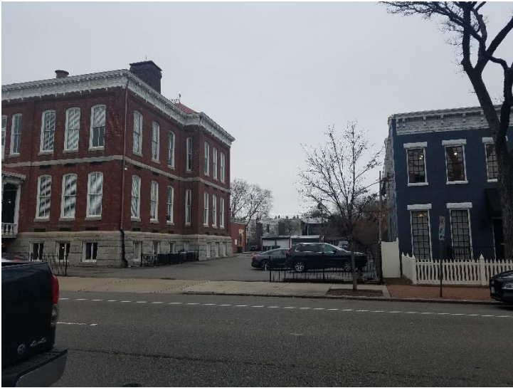
Figure 1. 1518 West Main Street