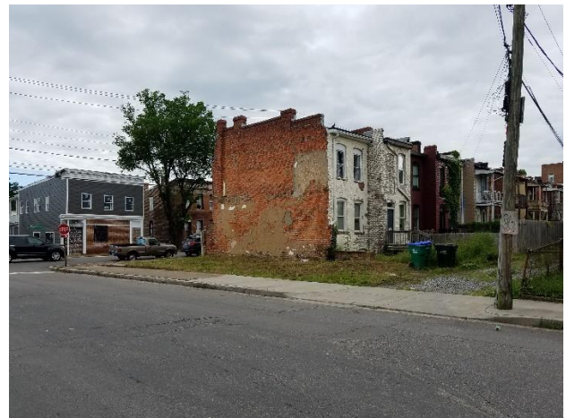
Figure 4. 2301 Venable Street.