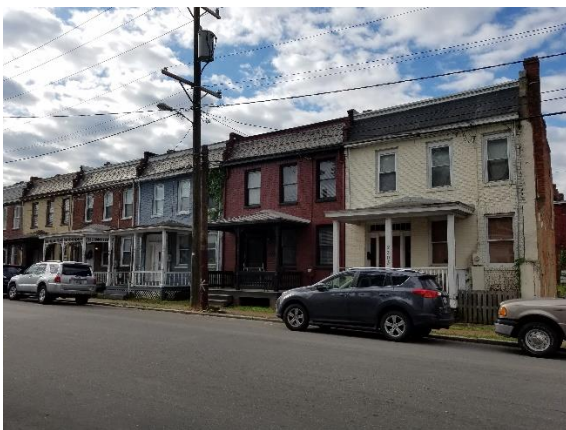
Figure 5. 2300 block of Venable Street.