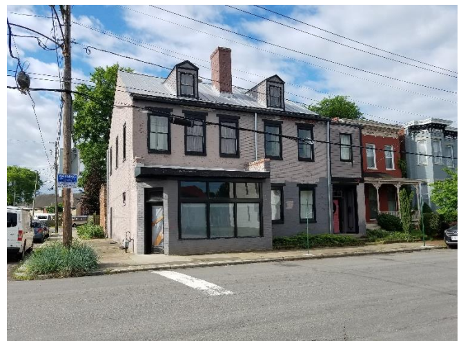
Figure 6. 2200 block of Venable Street.