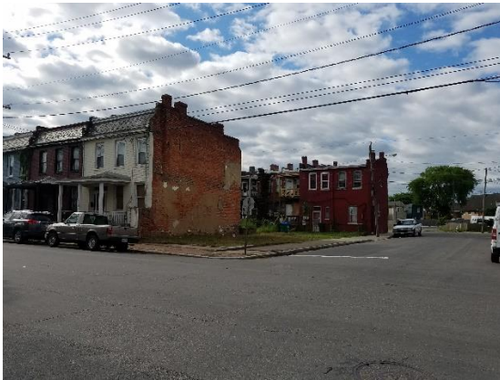
Figure 3. 32301 Venable Street.