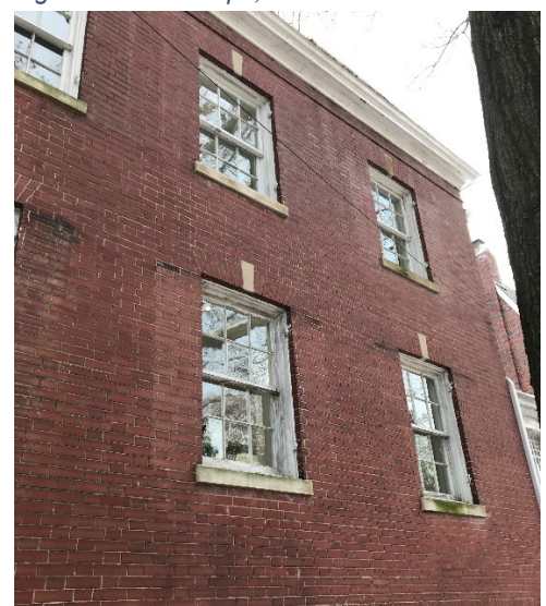
Figure 6. Windows on Davis Ave elevation with shutter hardware.