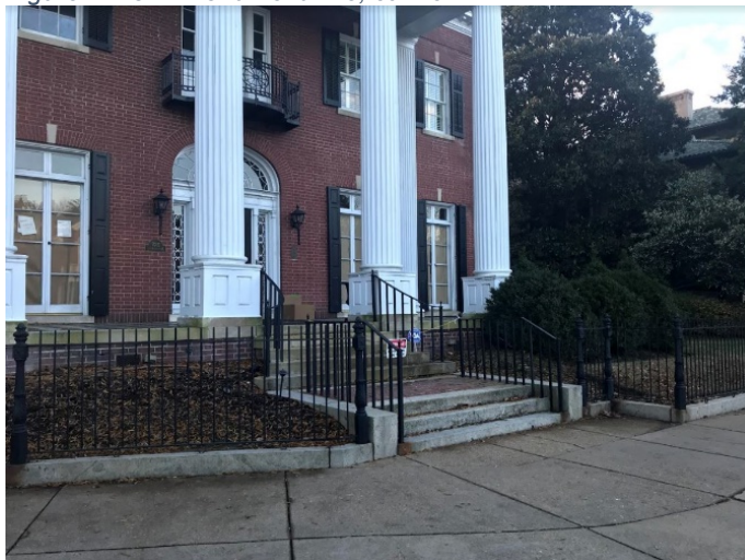
Figure 3. 2327 Monument Ave, 2018