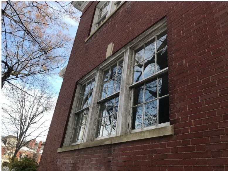
Figure 5. Windows on Davis Ave elevation with no shutter hardware.