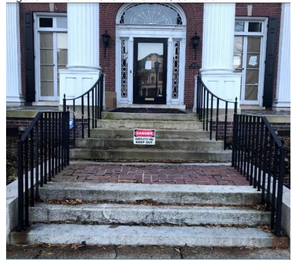
Figure 4. Front steps, 2327 Monument Ave