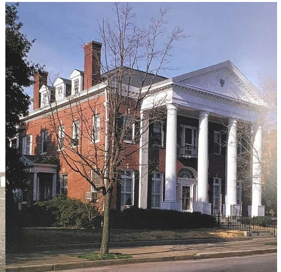
Figure 2. 2327 Monument Ave, ca. 2001