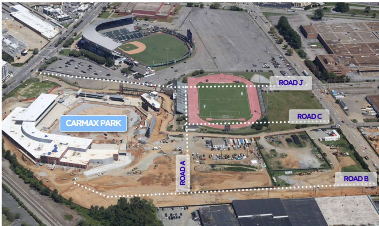
Exhibit B: Aerial image taken August 22, 2025 shows the alignment of future roads on the current site

The Diamond District redevelopment is a once-in-a-generation opportunity to transform a 67-acre underutilized site into a regional destination anchored by a new 9,000-seat CarMax Park minor league baseball stadium. The Diamond District redevelopment is a regionally significant project that directly implements multiple adopted planning priorities. Identified in the Richmond 300 Master Plan as a Priority Growth Node, supported by the Richmond Connects Multimodal Transportation Plan, and acting as a key destination along the Fall Line Trail, this project embodies the region’s shared goals for multimodal connectivity, economic growth, and sustainable land use.