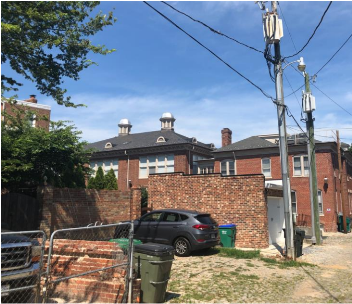
Figure 5. View of the rear of the property facing west.