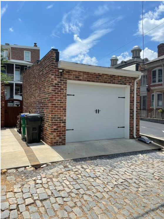
Figure 9. Rear garage across the alley from the property