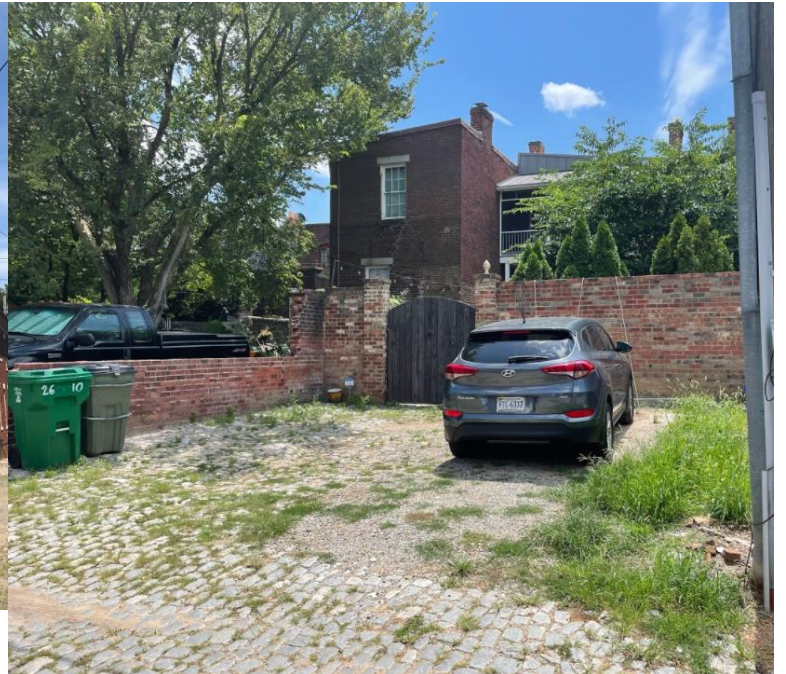
Figure 6. View of the rear of the property from the alley