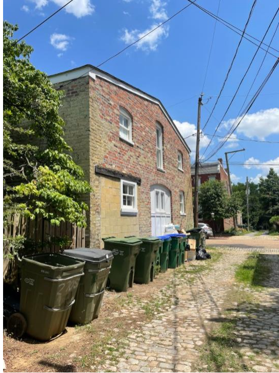
Figure 8. 2-story carriage house across the alley from the property