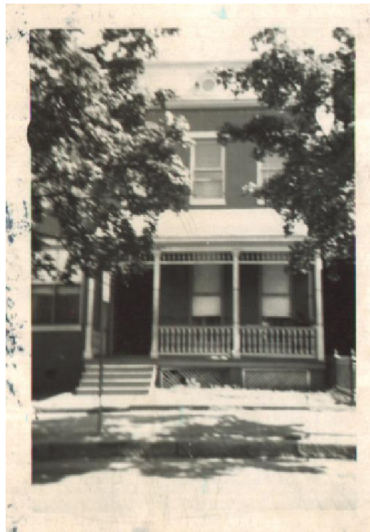
Figure 2. Historic photo from Assessor's Office