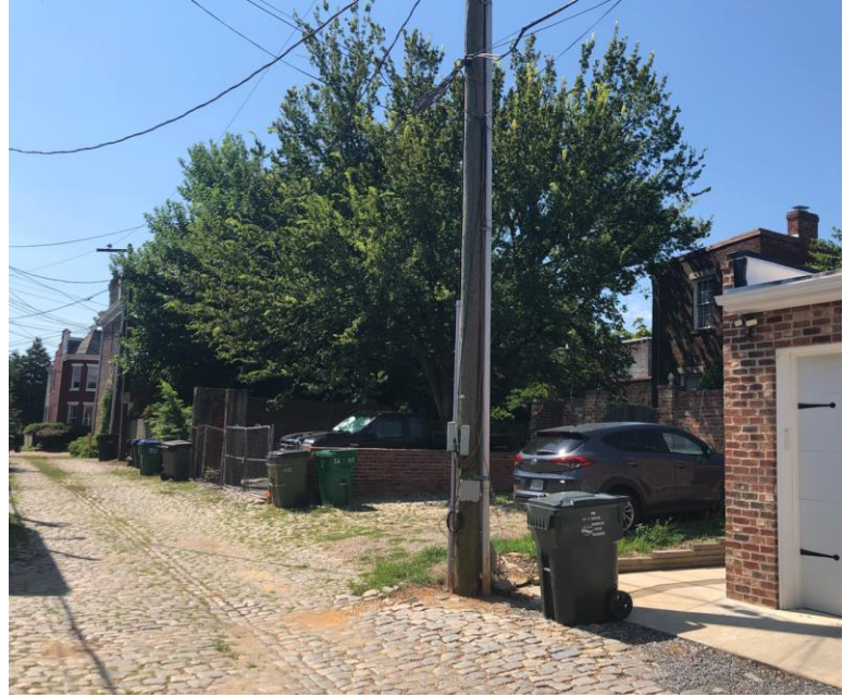
Figure 4. View of the rear of the property facing east.