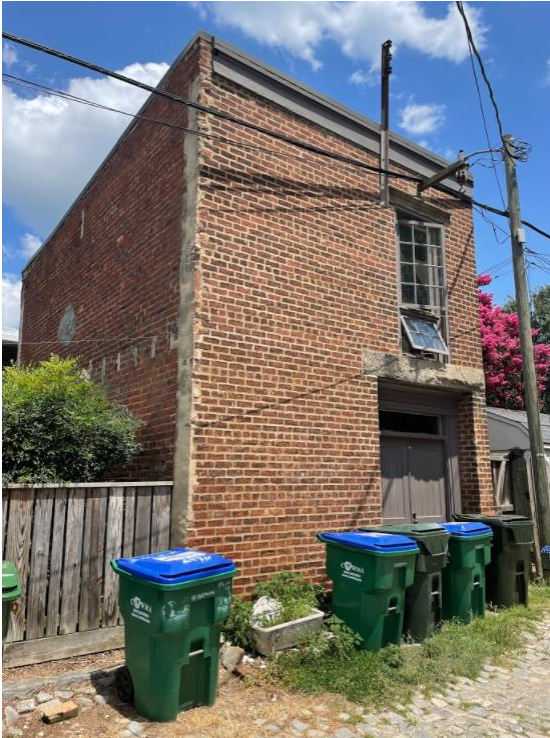
Figure 7. 2-story carriage house across the alley from the property