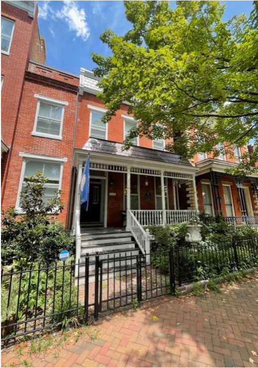
Figure 3. Front façade of building