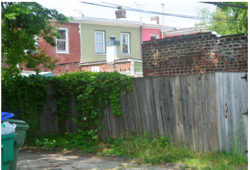
Figure 4. Rear view of 613 North 1 st Street. The house is the red painted brick dwelling and there is evidence of a historic one-story, rear addition.