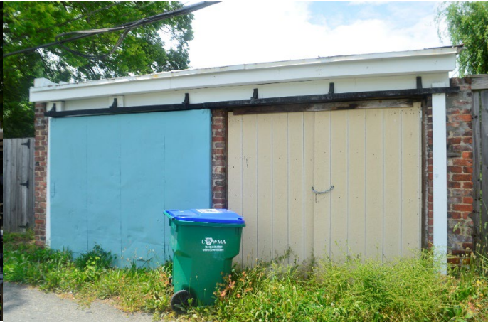
Figure 2. The west section is the rear garage for 613 North 1 st Street.