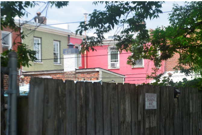
Figure 7. View of the two-story rear stuccoed addition on 617 North 1 st Street.