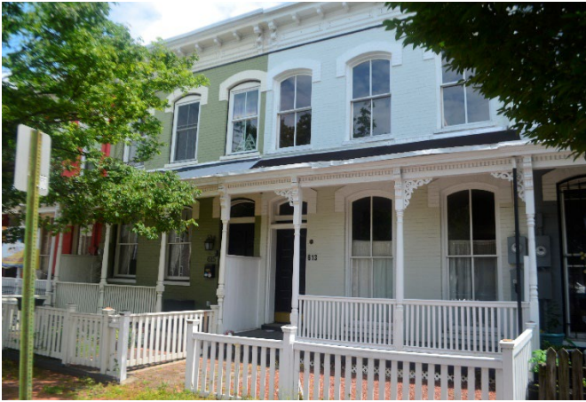
Figure 1. Front façade of 613 North 1 st Street