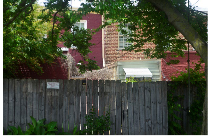
Figure 6. View of 607, 609 and 611 North 1 st Street, each with rear, one-story additions.