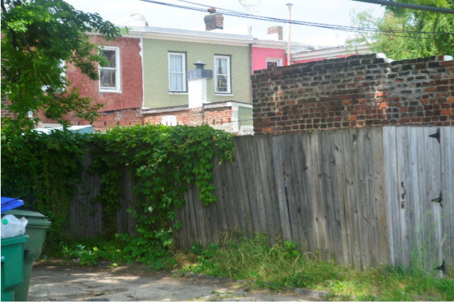
Figure 5. View of the rear of 613 and 615 North 1 st Street. The existing one-story addition on the back of 615 North 1 st Street has a brick chimney. The proposed addition on 613 North 1 st Street will extend ten feet and will not interfere with the neighboring chimney.