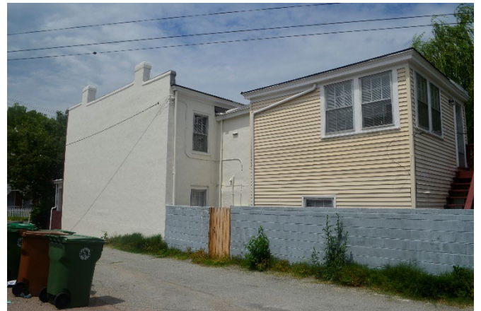
Figure 8. View of the two-story addition on 601 1/2 North 1 st Street. This property is on the south corner of the block on north 1 st Street.