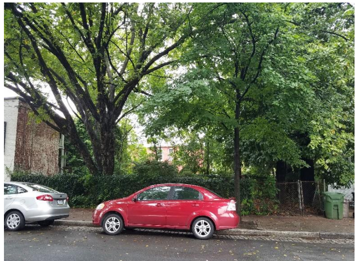
Figure 2. View towards proposed new free-standing construction from North 24th Street.