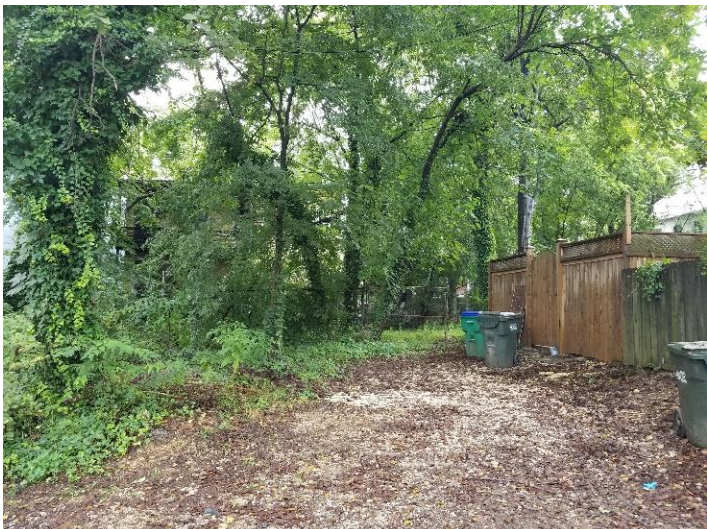
Figure 1. 2320 E. Marshall Street, rear, proposed location of new free-standing construction.