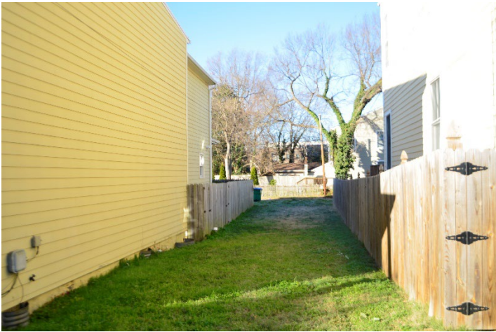
Figure 3. View to the north of 972 Pink Street, and approximate view of the new garage.