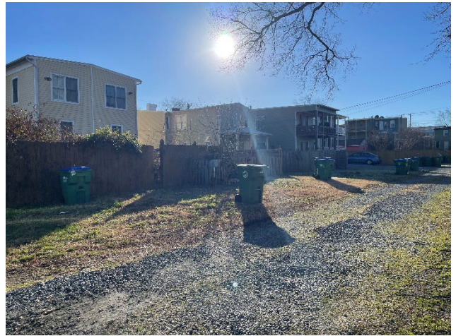
Figure 6. View from Carrington Street, looking up the public alley to 972 Pink Street. 972 Pink Street is the second dwelling on the left of the photograph.