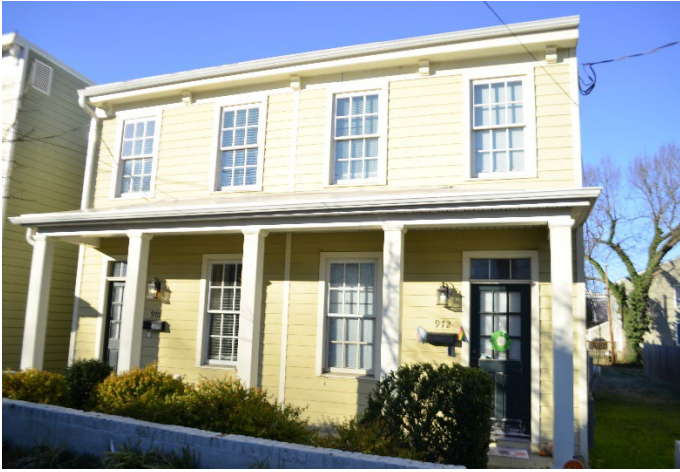
Figure 1. View of 970-972 Pink Street facades.