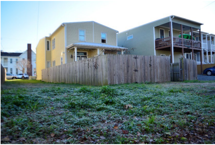
Figure 5. Rear view of 972 Pink Street, from the public alley.