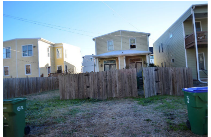
Figure 4. Rear view of 970-972 Pink Street, from the public alley.