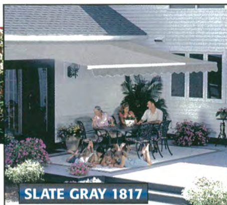
SLATE GRAY 1817