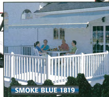
SMOKE BLUE 1819