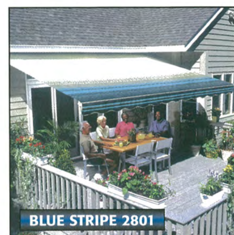
BLUE STRIPE 2801