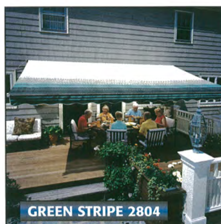
GREEN STRIPE 2804