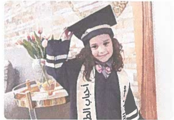
4:59 AM - Feb 10, 2024 - 27.2K Views