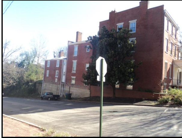
19 North 29 th Street

With this application, the applicant is proposing to eliminate the side entrance and enclose the existing porch with glazing and wood panels. The applicant is proposing to construct a 4-story addition at the rear of the structure to be the same height of the existing structure. The proposed addition will be clad in opaque and glass panels and will have a projecting rear porch. At the rear of the addition, the applicant is proposing to construct a 2-story, 2 car, single-bay garage oriented to the alley. The proposed garage will be constructed of brick and will have a roof top deck.