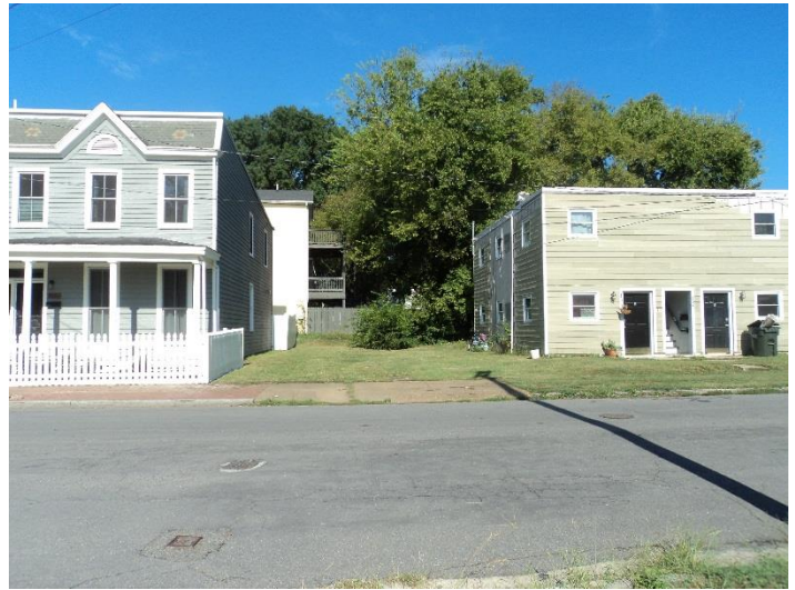
Figure 2. 802 North 22nd Street.