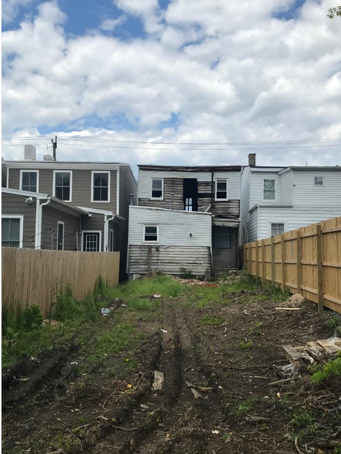
Figure 1. View of rear of 2017 Venable Street from alley, looking north