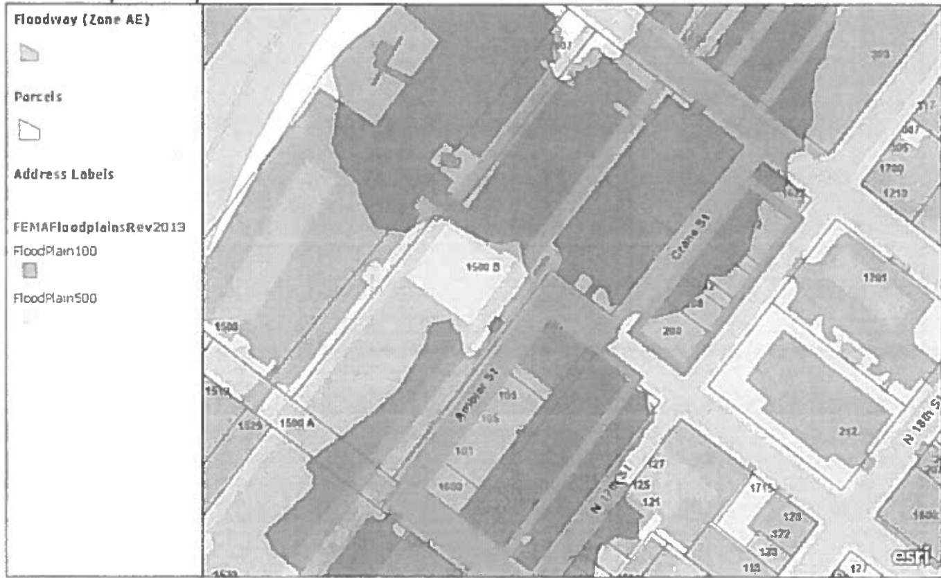
This map shows the 100 and 500 year floodplains, base flood elevations, and cross sections of the James River in the City of Richmond