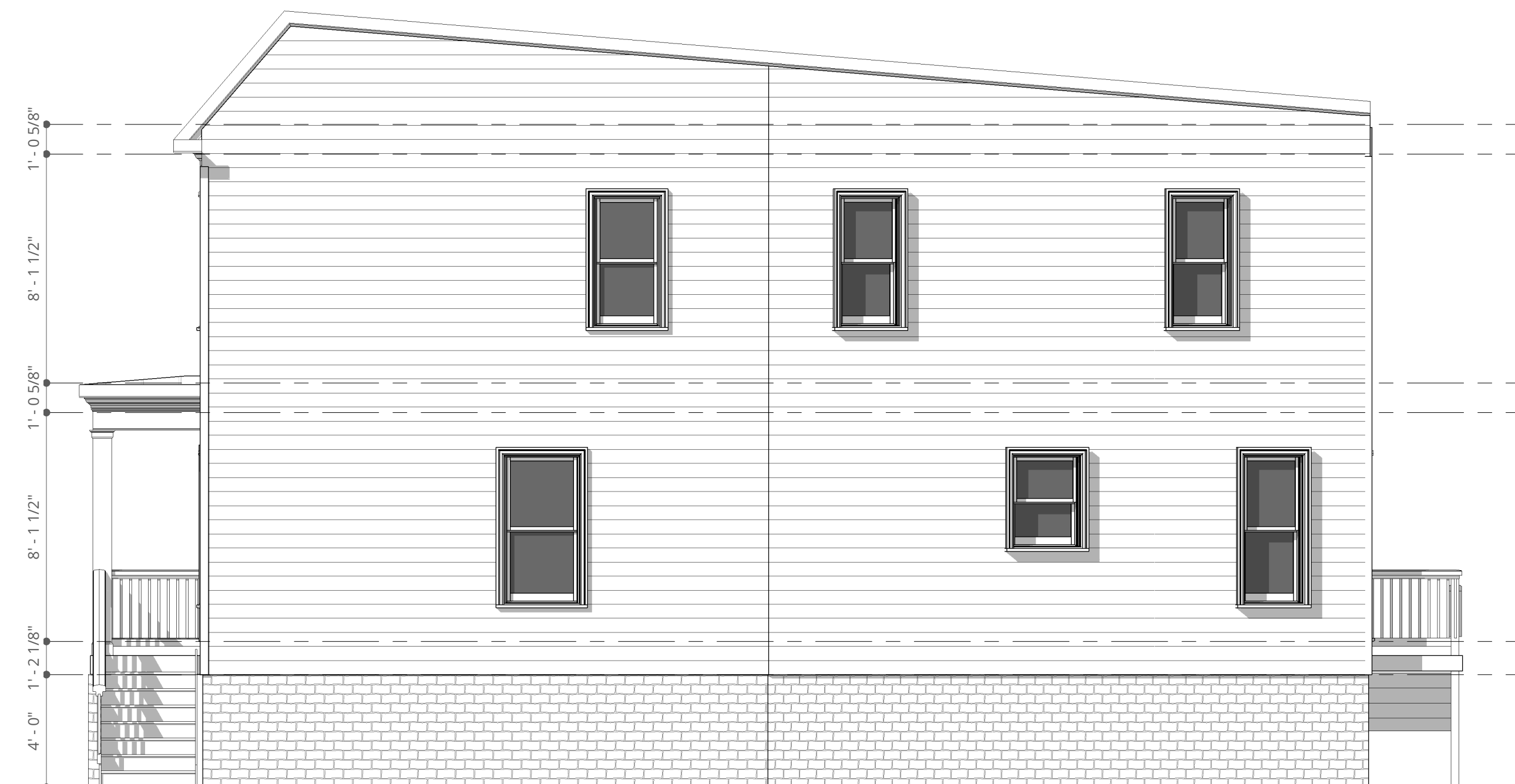
RIGHT ELEVATION 1/4" = 1'-0"