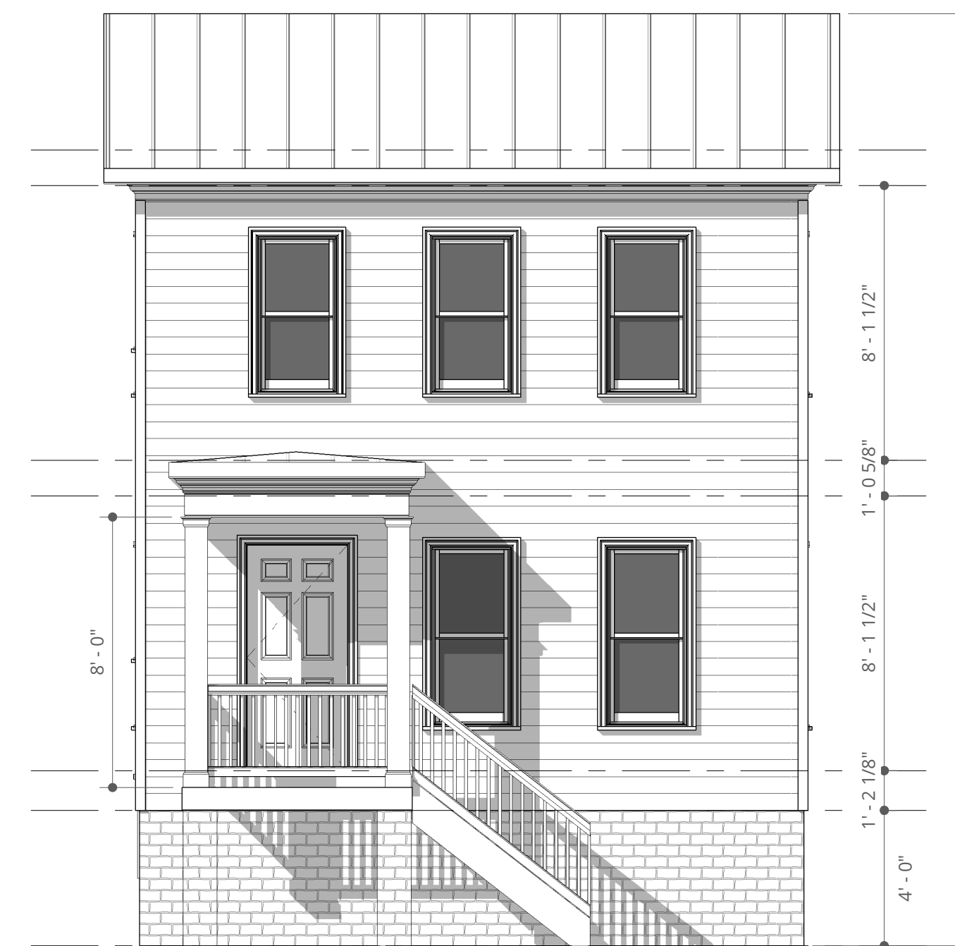
FRONT ELEVATION 1/4" = 1'-0"