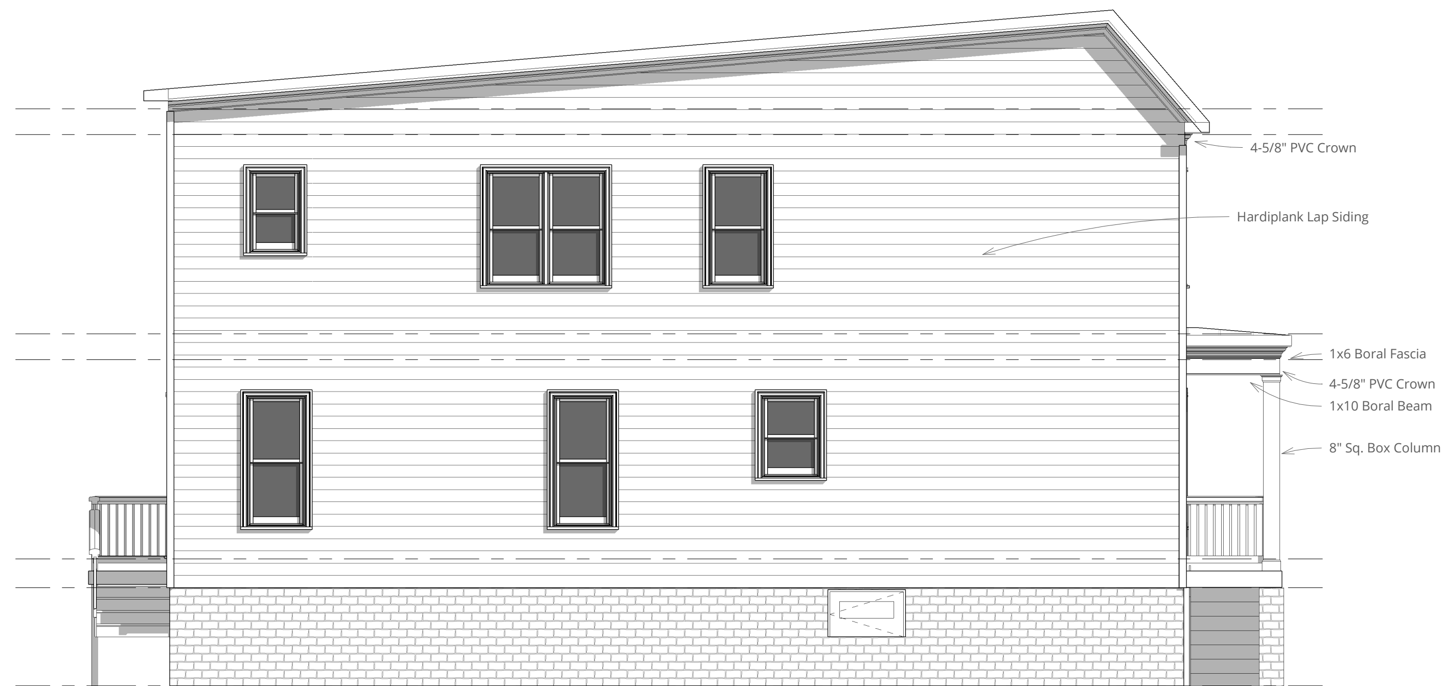
LEFT ELEVATION 1/4" = 1'-0"