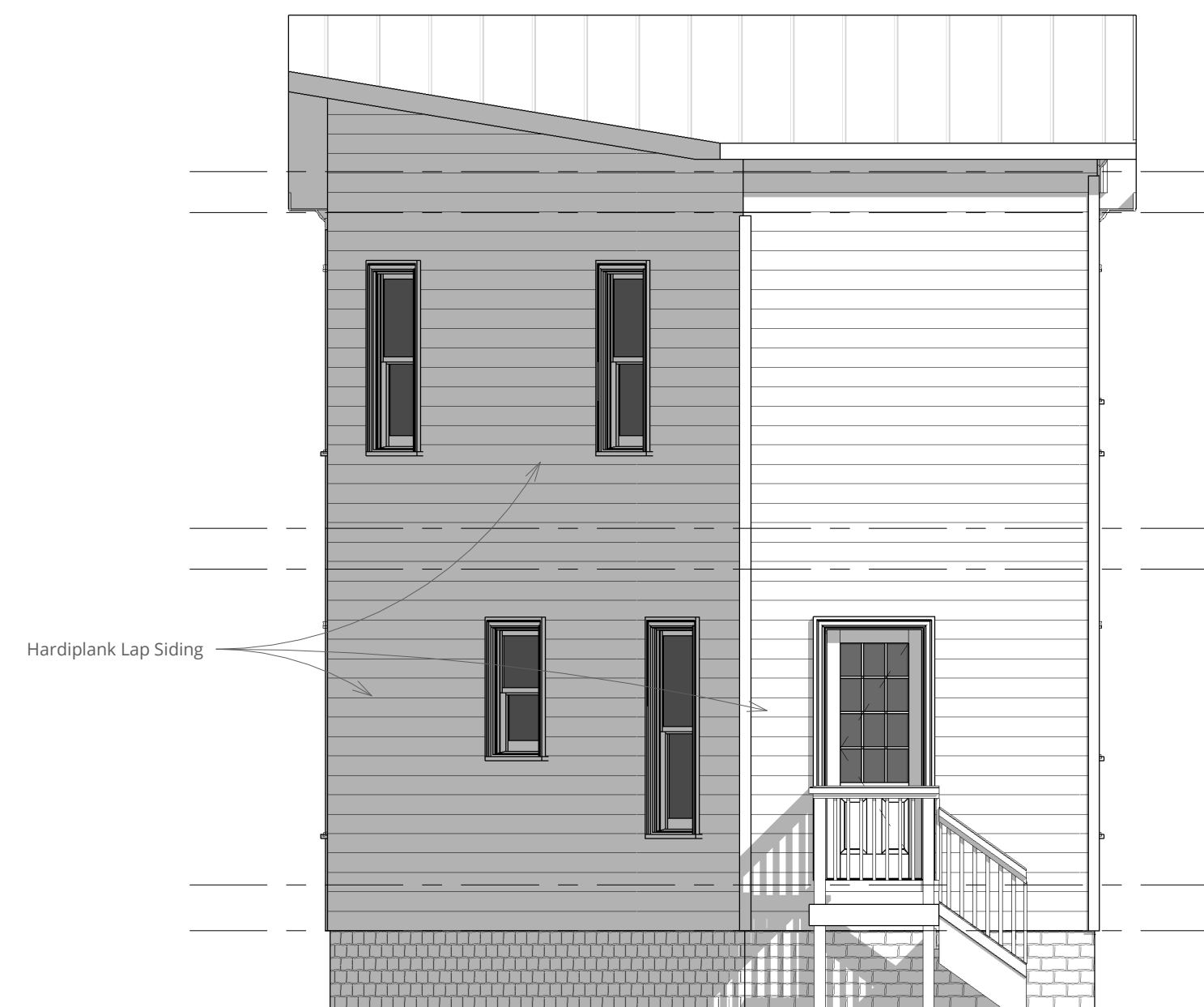
REAR ELEVATION 1/4" = 1'-0"