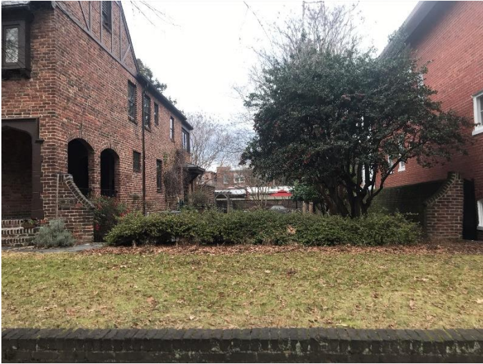
Figure 1. 3310 Monument Ave, view of side yard from street.