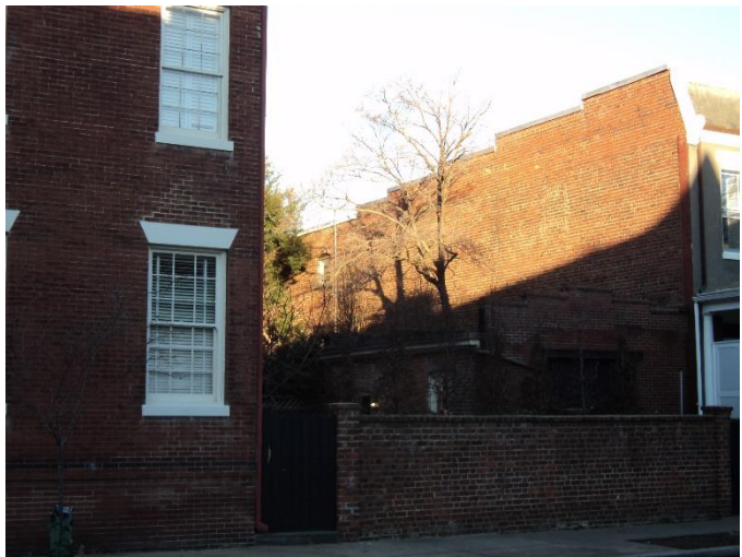
Figure 4. View of garage openings from Park Avenue