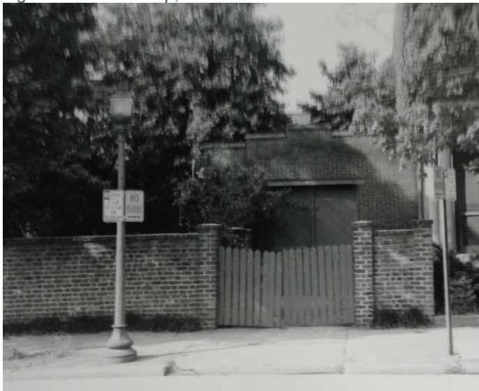
Figure 3. 401 North Allen Avenue, ca. 1980, garage in rear