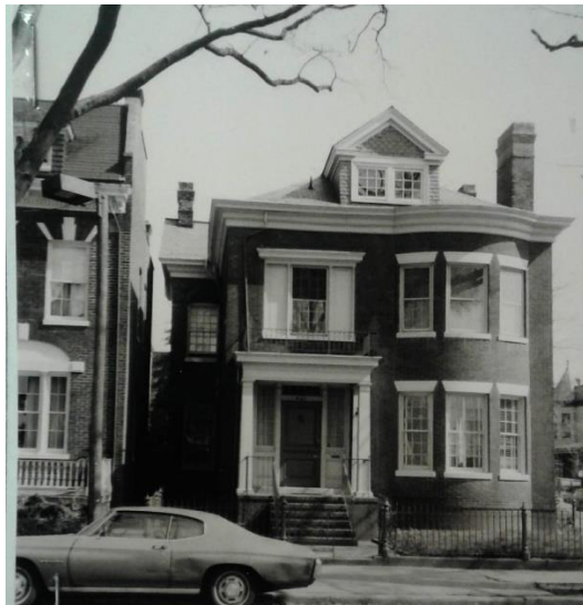
Figure 2. 401 North Allen Avenue, façade ca. 1980