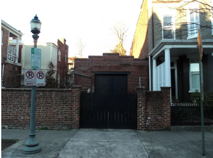
Figure 4. Existing garage and gate