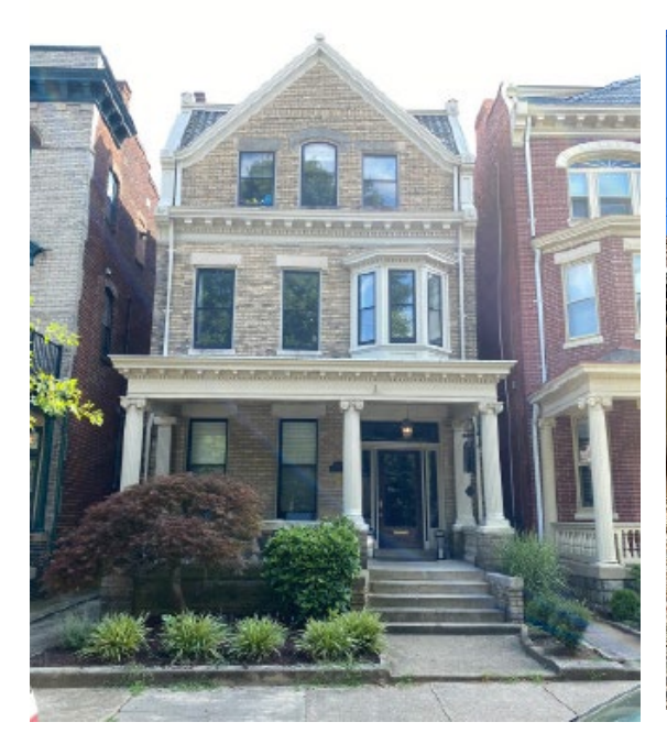
Figure 2. 2003 West Grace Street - Rear façade of property looking South