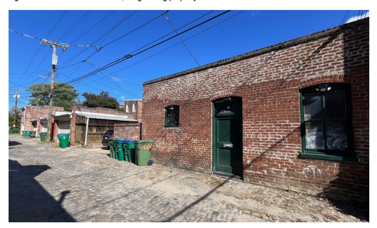
Figure 4. South side of alley opposite of project site, looking West.