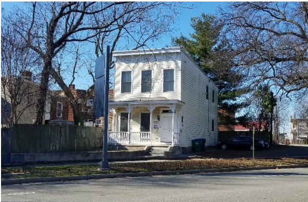
Figure 5. 606 Chamberlayne Parkway