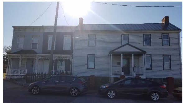
Figure 6. 137-133 West Jackson Street.