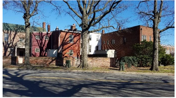
Figure 8. Rear of buildings at 101-105 West Jackson Street, view across Chamberlayne Parkway.