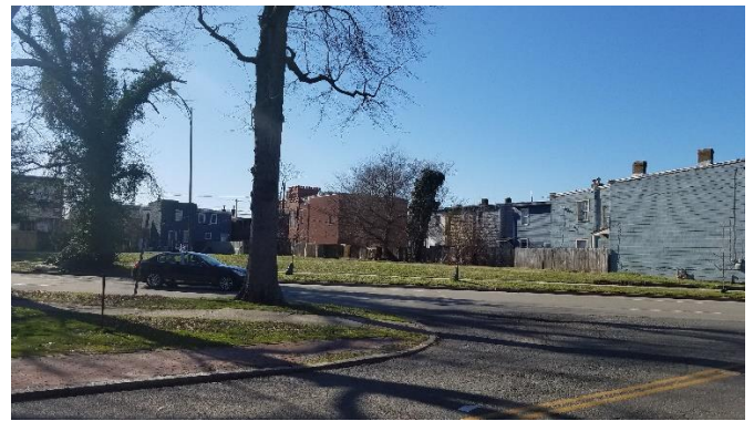
Figure 4. 620 Chamberlayne Avenue.