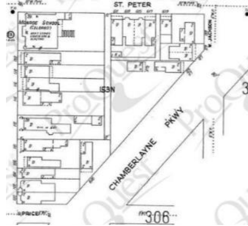
Figure 2. 1925-1952 Sanborn Map.