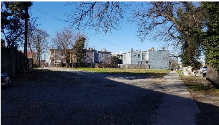
Figure 3. 620 Chamberlayne Parkway