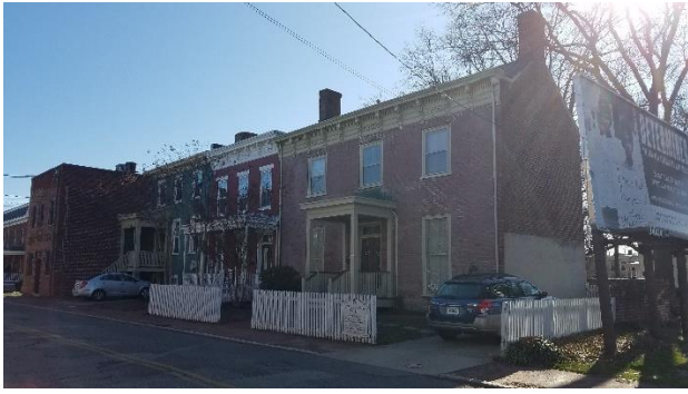
Figure 7. 101-105 West Jackson Street.