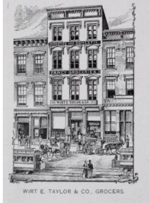
Figure 2. 1315 East Main Street, illustration from 'The City on the James', 1893.