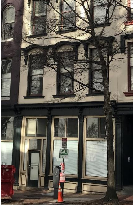
Figure 1. 1315 East Main Street, 2020