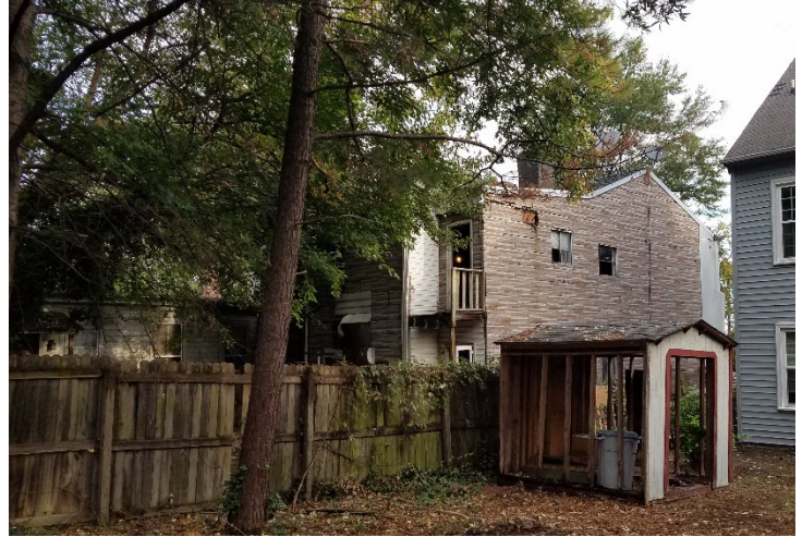
Figure 2. View of east elevation from alley