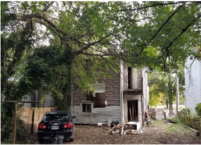
Figure 3. View of south elevation from alley