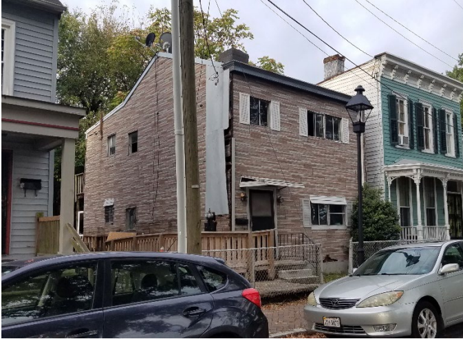
Figure 1. 517 Catherine Street, view from Catherine Street