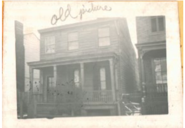
Figure 4517 Catherin Street, prior to 1963