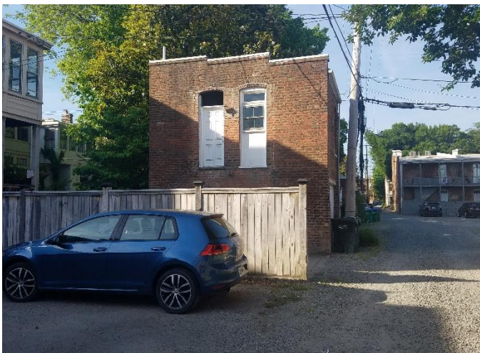
Figure 5. 18 N. Boulevard, carriage house.