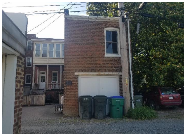
Figure 6. 18 N. Boulevard, carriage house.