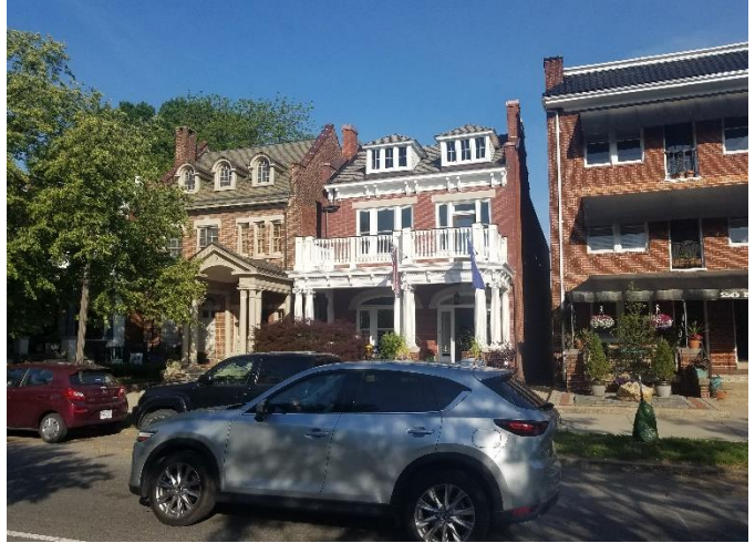
Figure 2. 18 N. Boulevard.