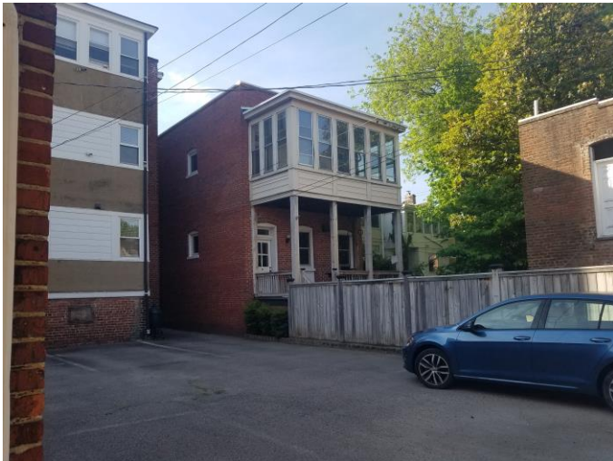
Figure 3. 18 N. Boulevard, rear view.