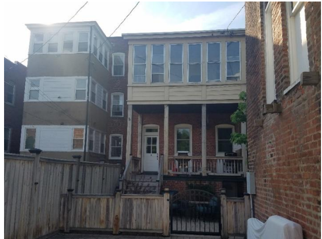
Figure 4. 18 N. Boulevard, rear view.