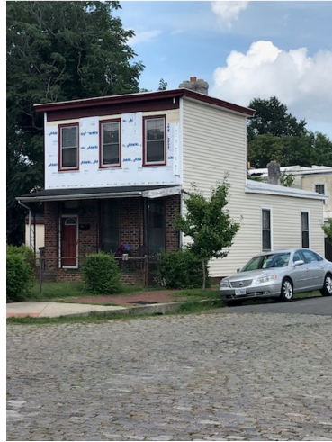
Figure 2. 2301 Burton Street, July 2019.