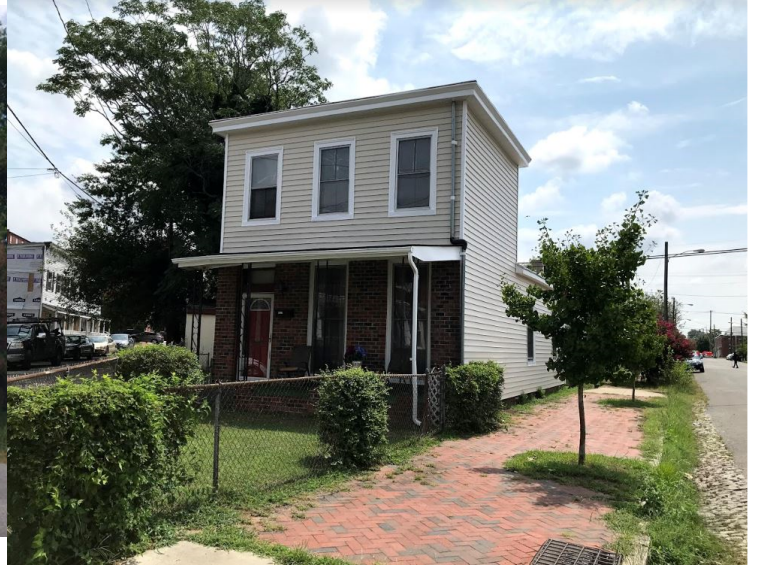
Figure 4. 2301 Burton Street, August 2019.