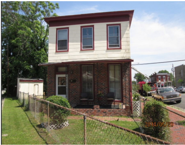
Figure 1. 2301 Burton Street, 2014.