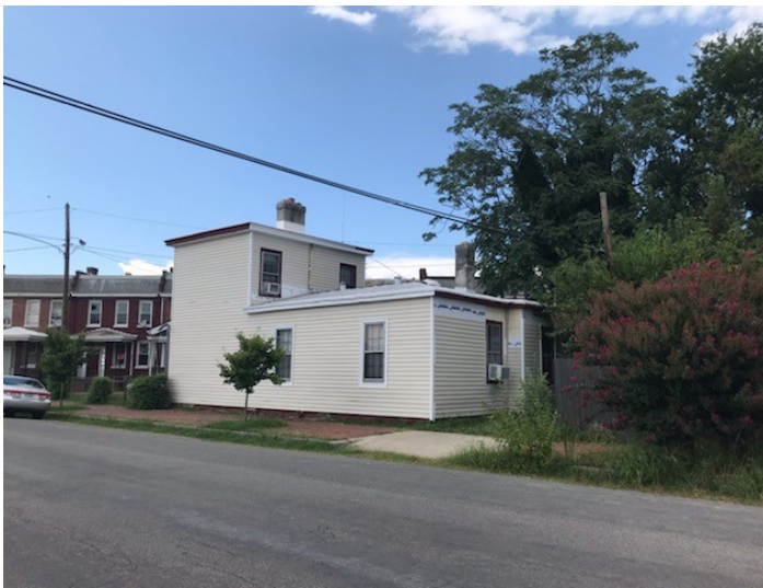
Figure 3. 2301 Burton Street, July 2019.