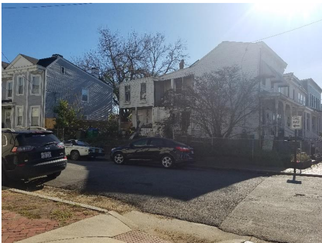
Figure 5. 619 North 21st Street, side elevation.