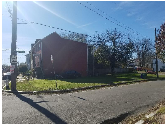
Figure 2. 618-620 North 21st Street.