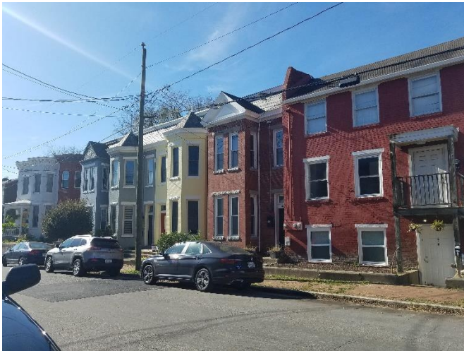
Figure 3. 608-615 North 21st Street.