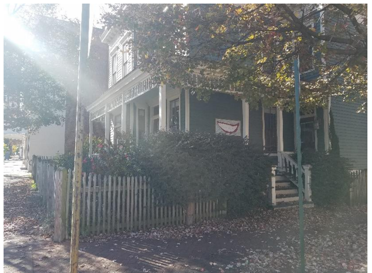
Figure 6. 424 North 25th Street with staggered bays, wrap porch, and front and side entry bays.