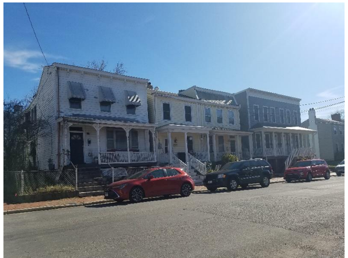
Figure 4. 611-619 North 21st Street.