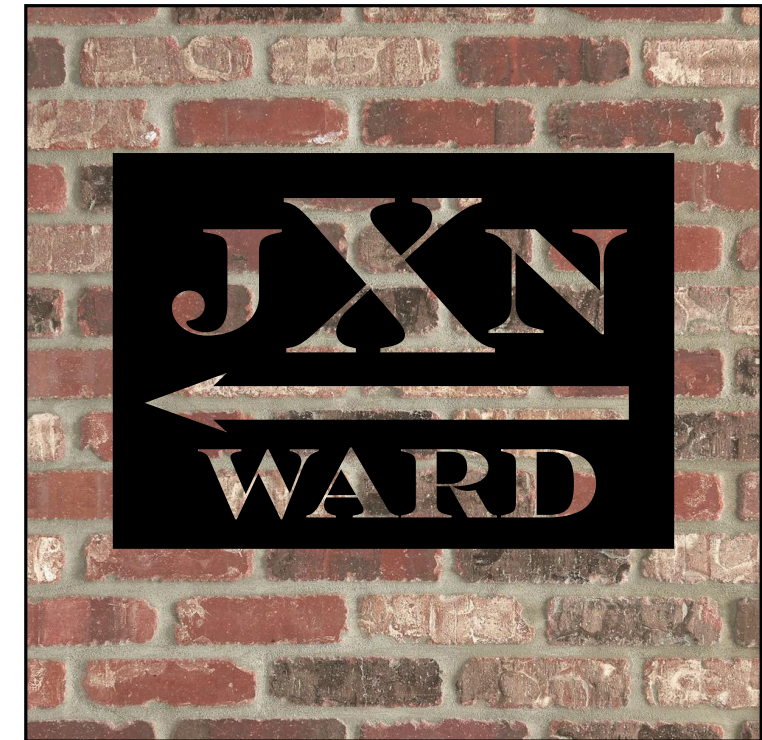
Example on brick surface

The proposed artwork above is a simplified version of the JXN Project logo (left). The logo serves as a scanable image that can be used with cell phone cameras, paired with built-in geo tags, to provide directions and greater context for the specific locations. Directional arrows anchored in the middle of the design, will visually indicate which way to navigate.