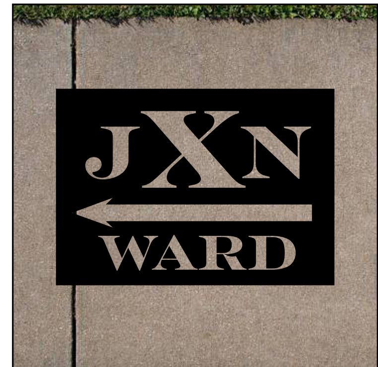
Example on concrete surface