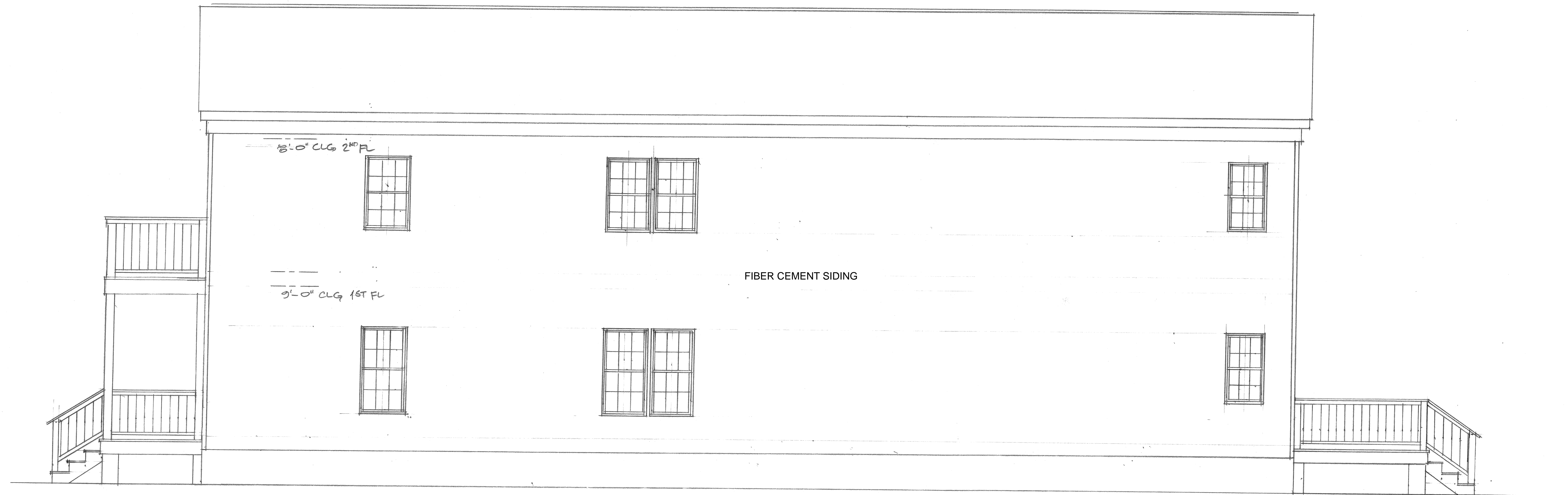
RIGHT ELEVATION 1/4"=1'-0"