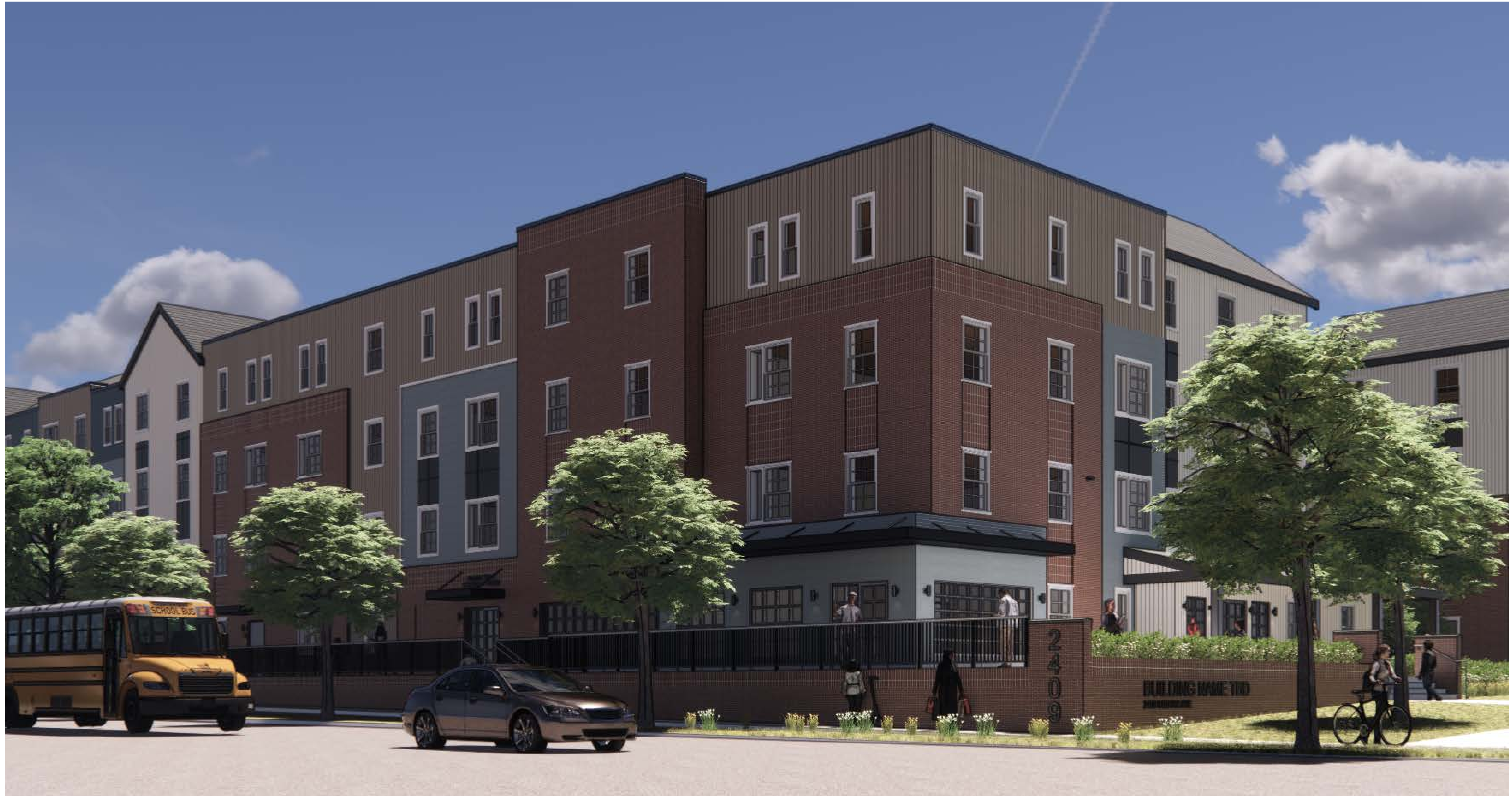
CONCEPTUAL RENDER - NOT TO SCALE

Oak Grove Development | 2200 Ingram Avenue March 29, 2023