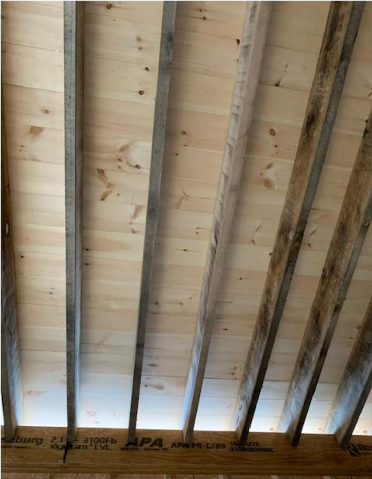
Pictures for Proposed work/new roof: 2 LVLs, rough cut rafters, and pine slats