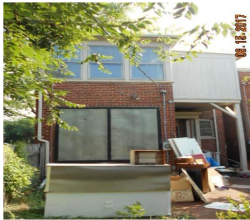
Figure 4. 3225 Monument, view of storm windows on rear elevation. 2017, City Assessor's Image.