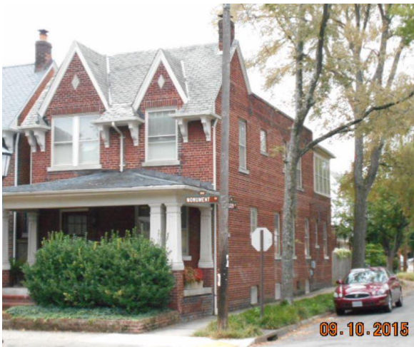
Figure 3. 3225 Monument, view of storm windows on front and side elevations. 2015, City Assessor's Image.