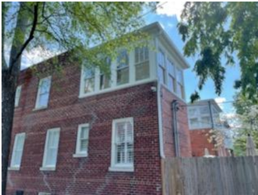
Figure 1. 3225 Monument, side and rear elevation from Tilden Street.