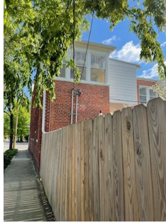
Figure 2. 3225 Monument, rear elevation from Tilden Street