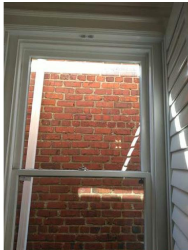
Figure 6. Commission Member site visit photo.