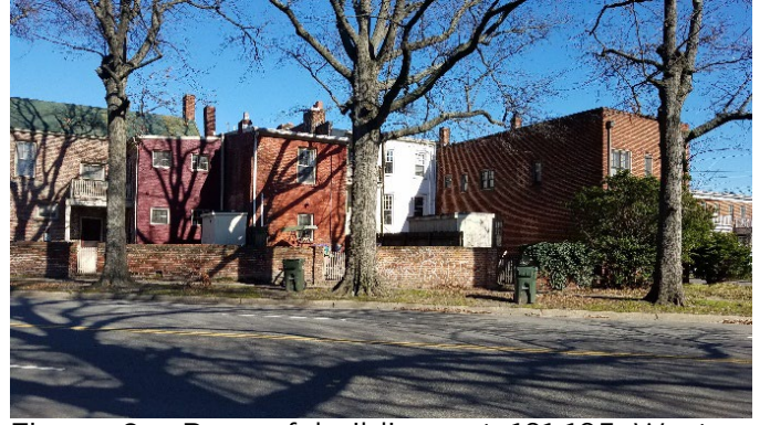
Figure 8. Rear of buildings at 101-105 West Jackson Street, view across Chamberlayne Parkway.