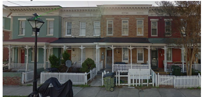
Figure 10. 619-625 St. James Street. Attached residences with a staggered setback and varying cornice detail.