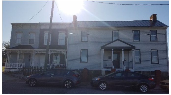
Figure 6. 137-133 West Jackson Street.