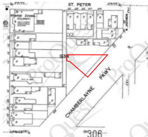
Figure 2. 1925-1952 Sanborn Map.