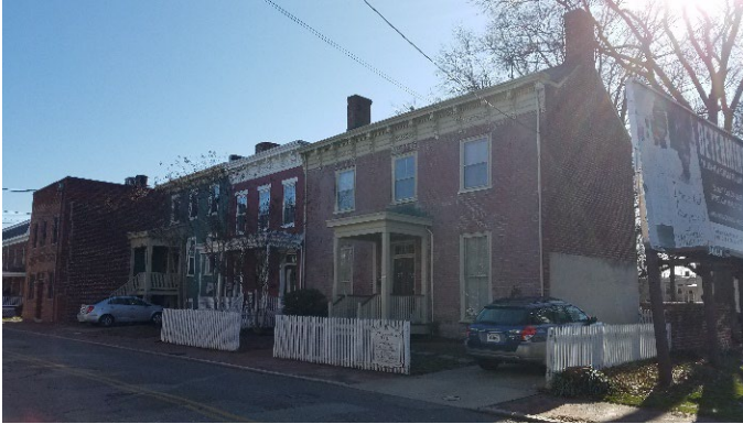
Figure 7. 101-1005 West Jackson Street.