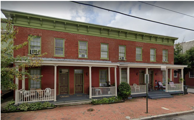
Figure 9. 3-5 E. Leigh Street. Attached residences that feature one material on front facade and combined front porches.