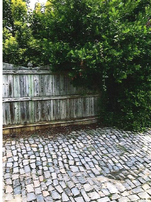
Figure 6. View of fence from alley.