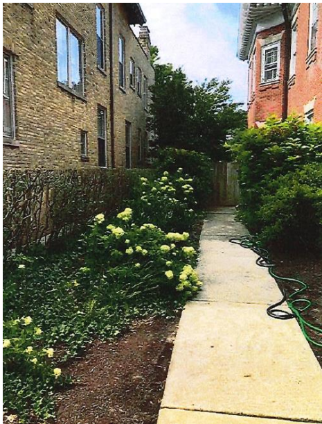
Figure 3. View of fence from Monument.