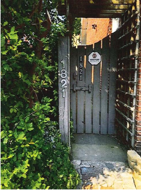
Figure 5. View of gate from alley.