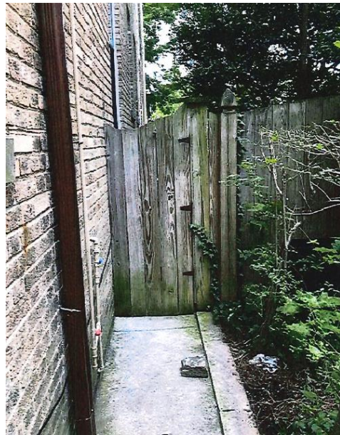
Figure 4. View of gate from Monument.