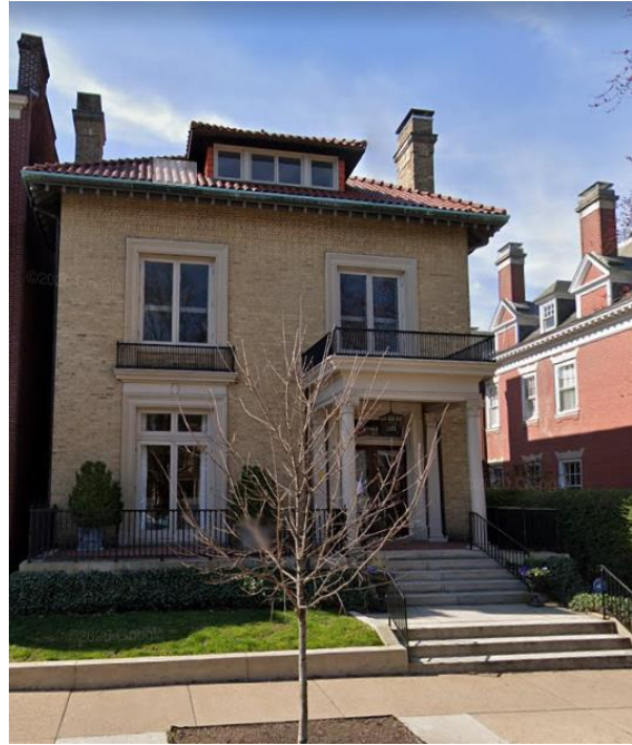
Figure 2. Façade photo