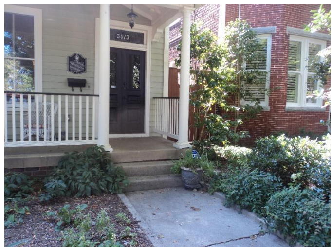
Figure 4. 3013 Libby Terrace, porch deck and stair detail.