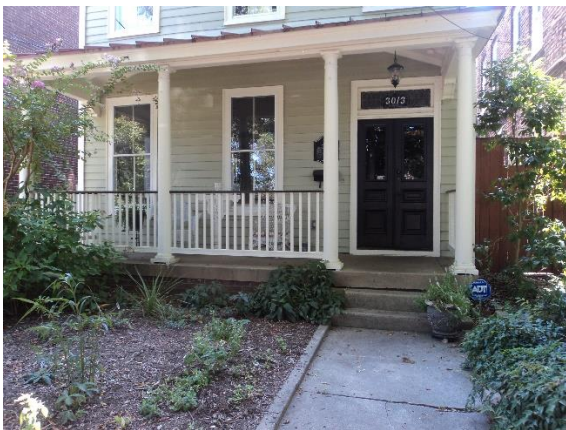
Figure 3. 3013 Libby Terrace, current conditions.