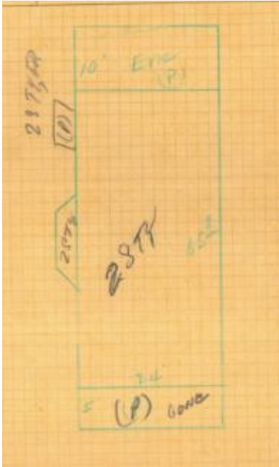
Figure 1. Image from 1957-1977 assessor's card.