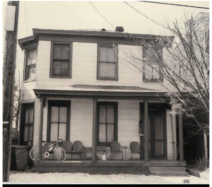
Figure 2. 3013 Libby Terrace, date unknown.