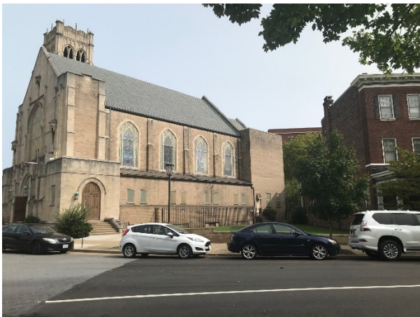
Figure 3. View of east elevation from West Franklin Street.