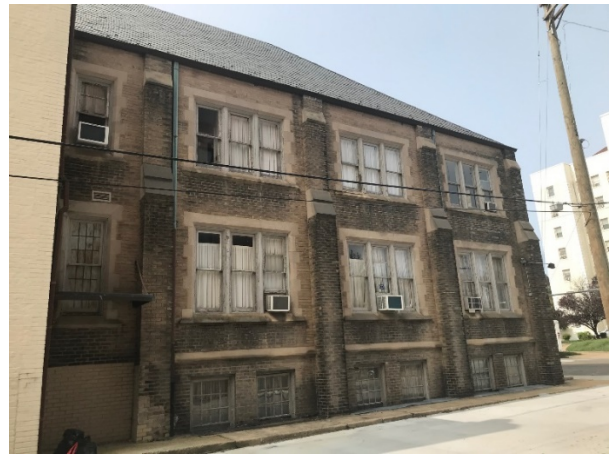
Figure 2. Existing window units.