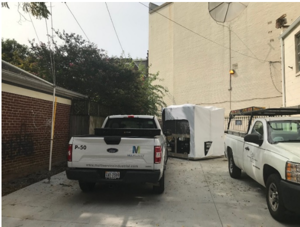
Figure 1. Location of ground-mounted HVAC equipment in the rear.