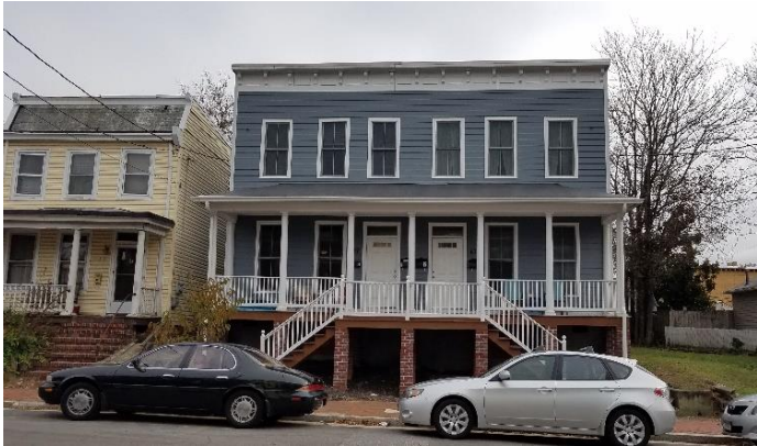
Figure 5. 611-613 N. 21st Street.