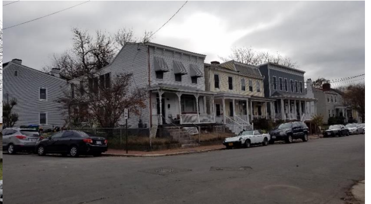
Figure 6. 615-619 N. 21st Street.