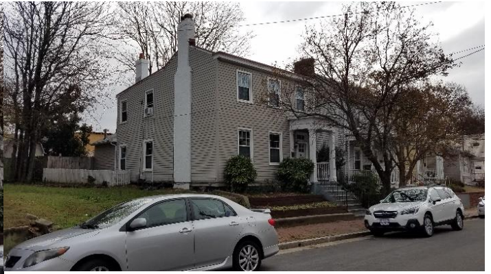
Figure 4. 607 N. 21st Street.