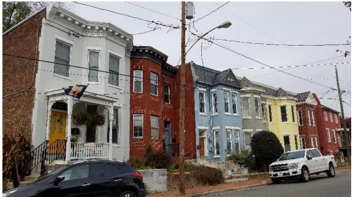
Figure 8. 608-612 N. 21st Street.