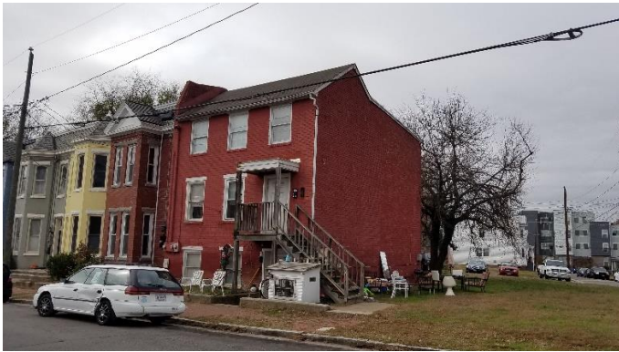
Figure 7. 612-616 N. 21st Street.