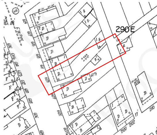
Figure 2. 609 N. 21st Street, 1950 Sanborn map.