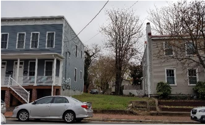
Figure 3. 609 N. 21st Street.