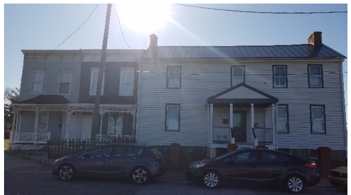
Figure 6. 137-133 West Jackson Street.