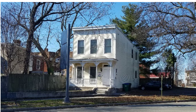
Figure 5. 606 Chamberlayne Parkway