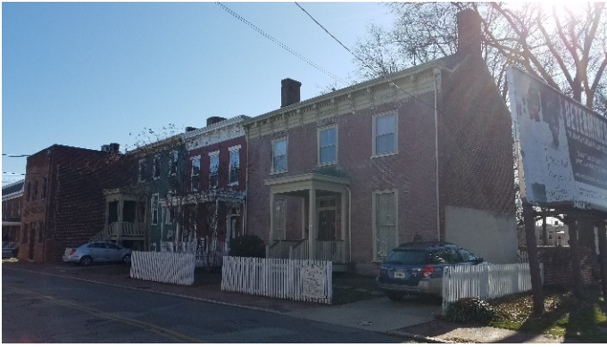
Figure 7. 101-1005 West Jackson Street.