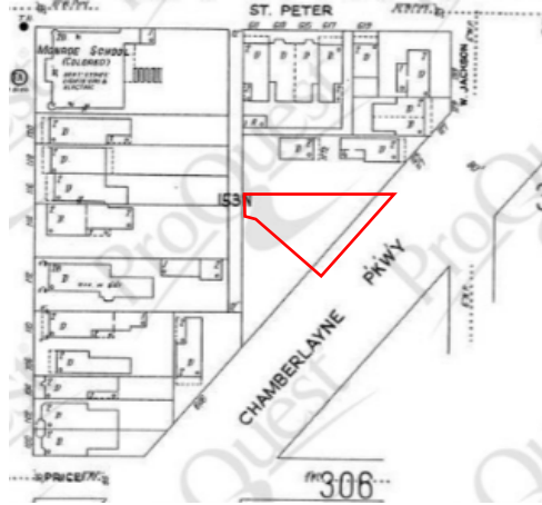
Figure 2. 1925-1952 Sanborn Map.