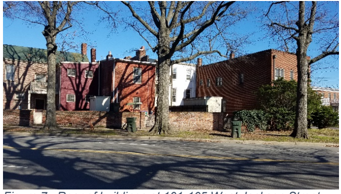
Figure 7. Rear of buildings at 101-105 West Jackson Street, view across Chamberlayne Parkway.