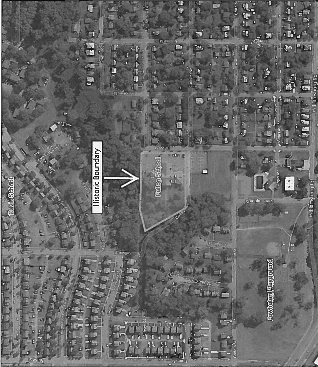
Title: Robert Fulton School