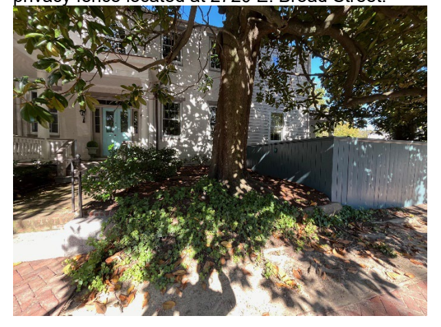
Figure 3. Existing magnolia tree, concrete curb, and privacy fence located at 2720 E. Broad Street.