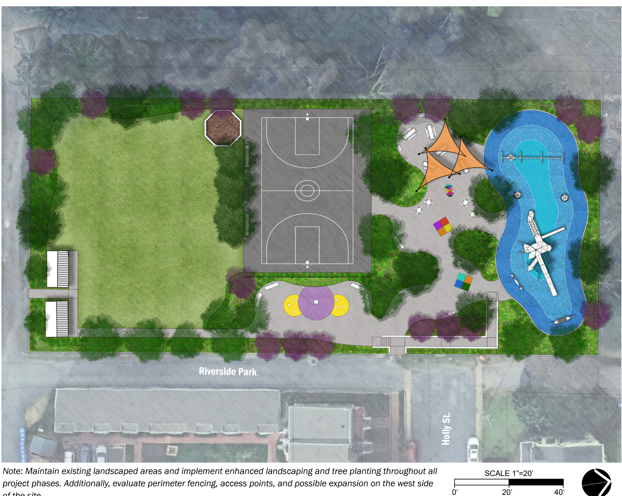
of the site.