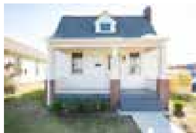
2010 Maury Street

Address: 1204 Hull Street, Richmond, Virginia