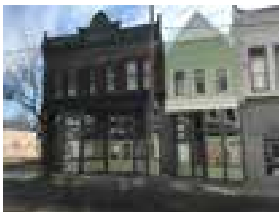
Unit 1D 1204-06 Hull St