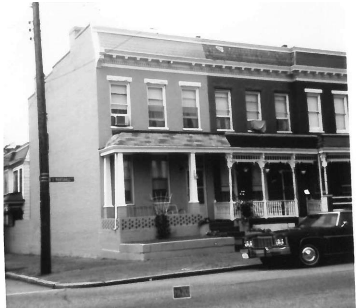
Figure 2. 2729 East Marshall St, 1977