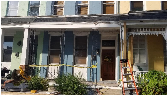
Figure 1. Front porch detail, July 2019