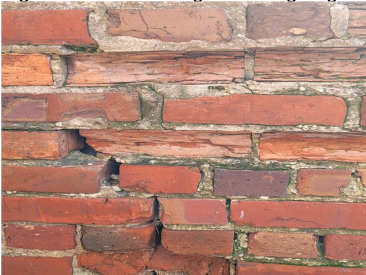
Figure 3. Deteriorating brick on garage.