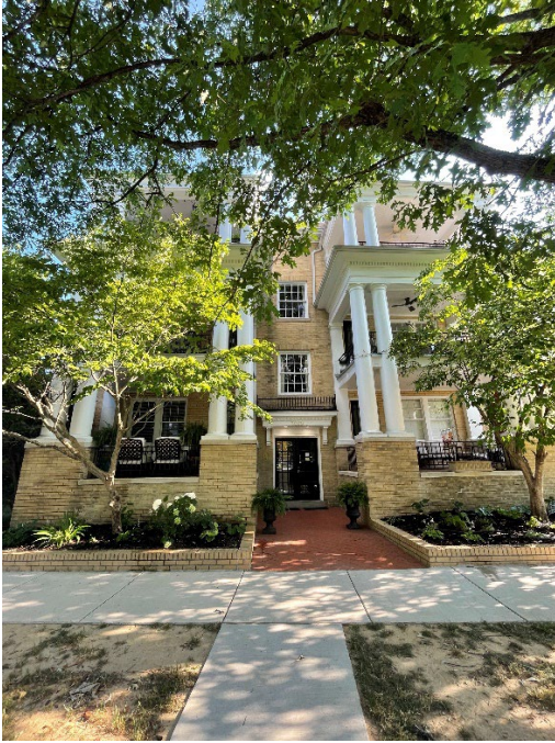
Figure 1. Façade of 3029 Monument Avenue.