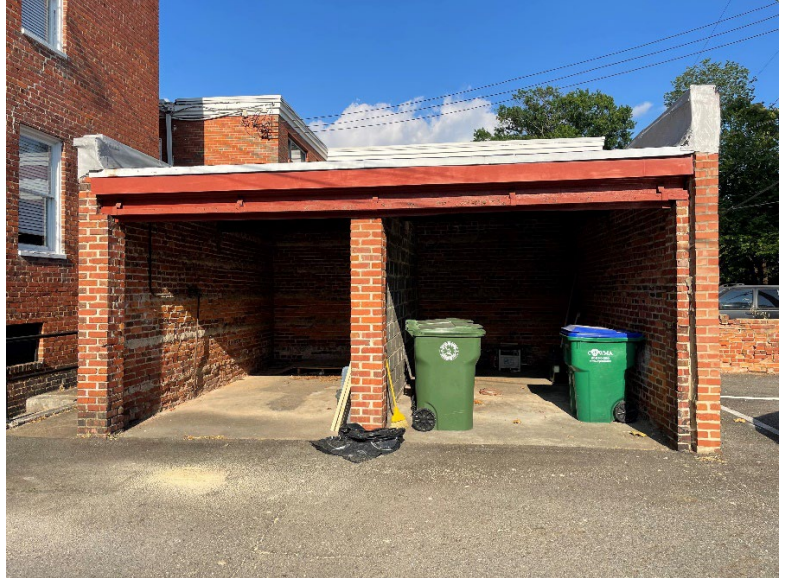
Figure 2. Existing Garage