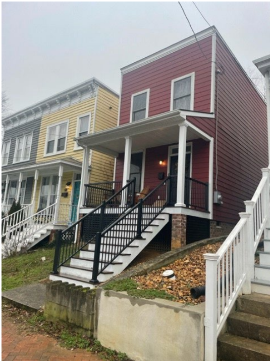
Figure 1. Subject property