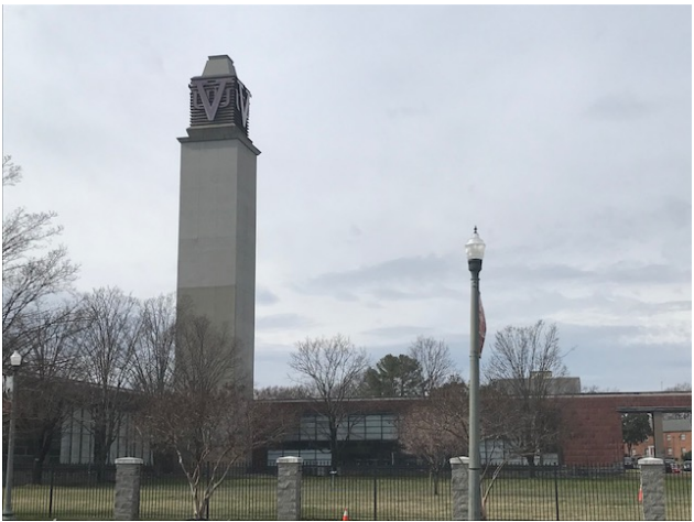
Figure 3. Belgian Building complex, current conditions.