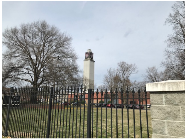
Figure 4. Belgian Building belfry, current conditions.