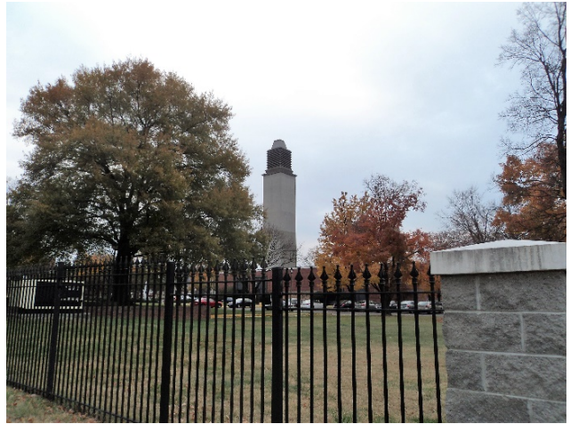
Figure 2. Belgian Building belfry, November 2019.