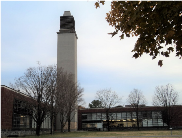
Figure 1. Belgian Building complex, November 2019.