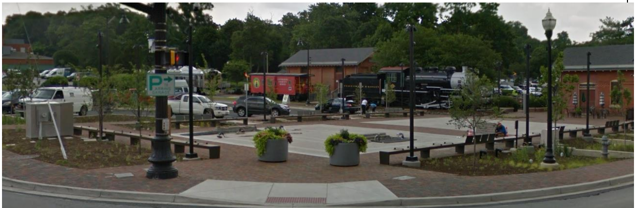
Example: City of Gaithersburg – Olde Town Plaza Splash Pad – Google StreetView 2018

The UDC provided a comment asking if the splashpad being located so close to the intersection of Franklin Street and 1 st Street would create a conflict of children possibly running into the street. Staff and the Applicant point to other examples of splashpads similarly situated near intersections that use seating walls, landscaping, and stormwater infrastructure to indicate users into the proper area. These elements are not included in the Concept plan due to the level of detailed required and will be fully detailed in the Final Application. Staff recommends that the final design include these elements for safety considerations.