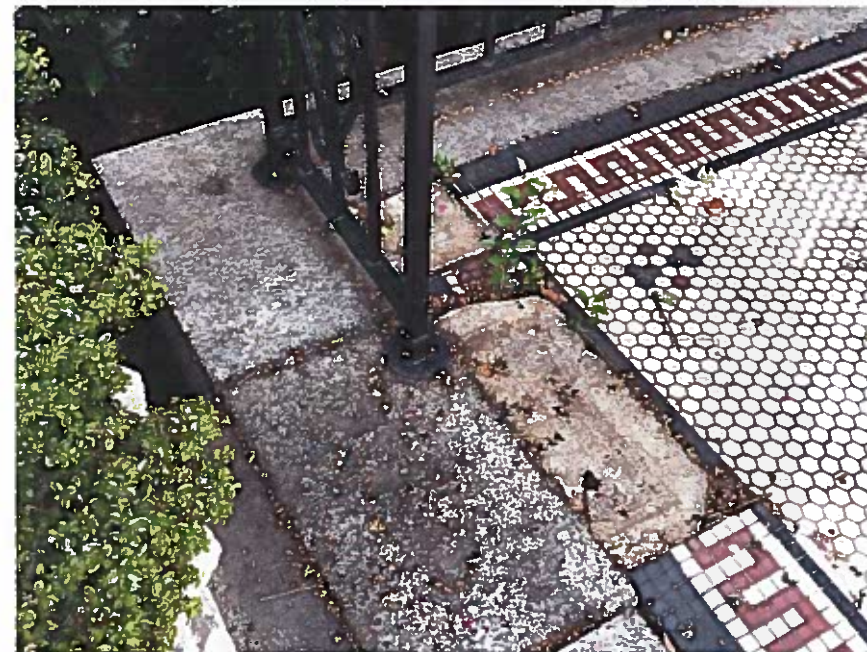
GHOSTING FROM ORIGINAL COLUMNS AT EXISTING TERRACE