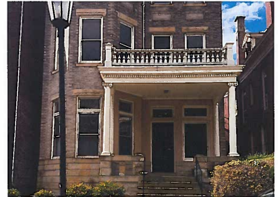
MONUMENT AVENUE PORCH PRECEDENT