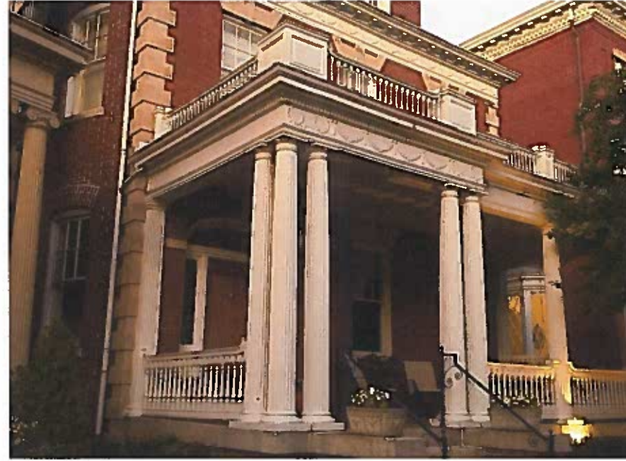
MONUMENT AVENUE PRECEDENT 3 COLUMNS