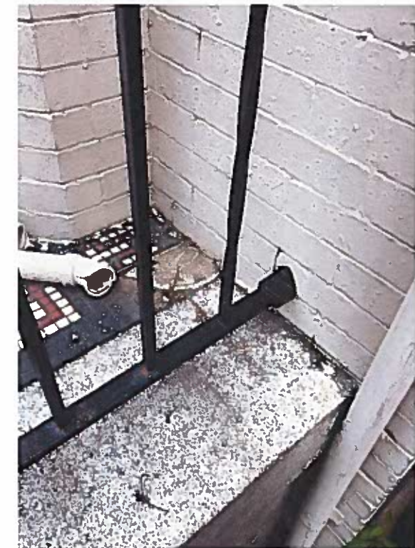
GHOSTING FROM ORIGINAL COLUMNS AT EXISTING TERRACE