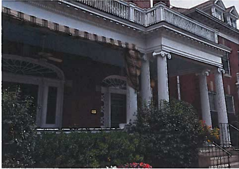
MONUMENT AVENUE PORCH PRECEDENT