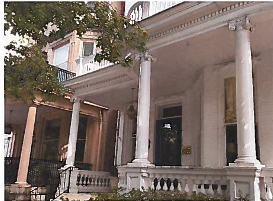
MONUMENT AVENUE PORCH PRECEDENT