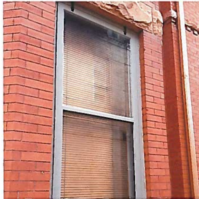
CUSTOM STORM WINDOW PRECEDENT