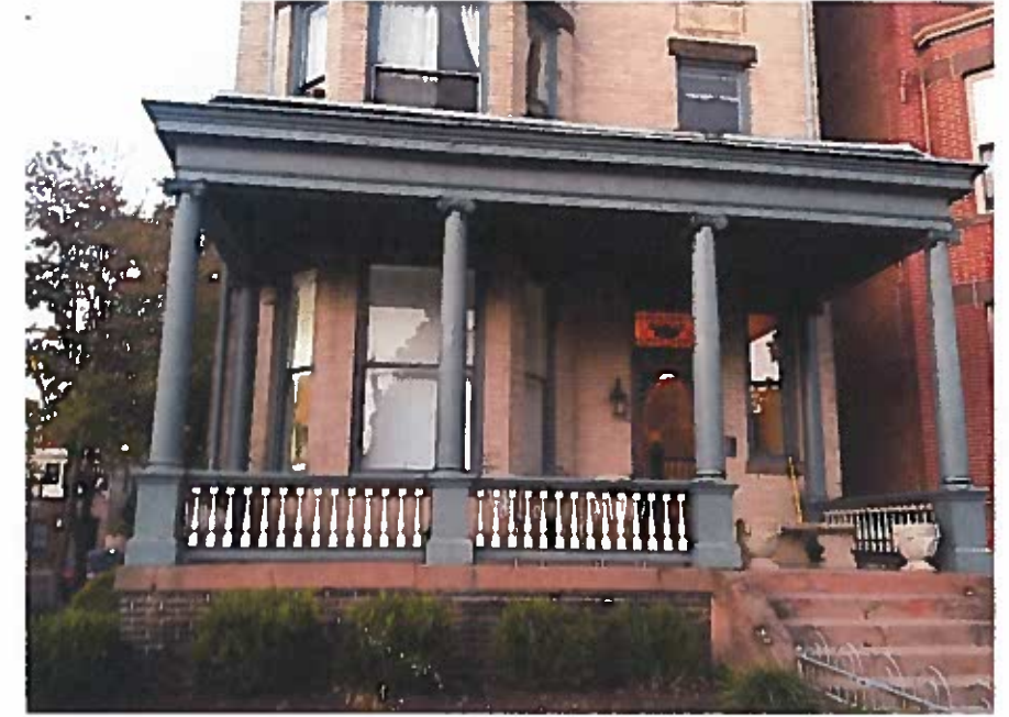
MONUMENT AVENUE PRECEDENT FULL PORCH AT BAY WINDOW