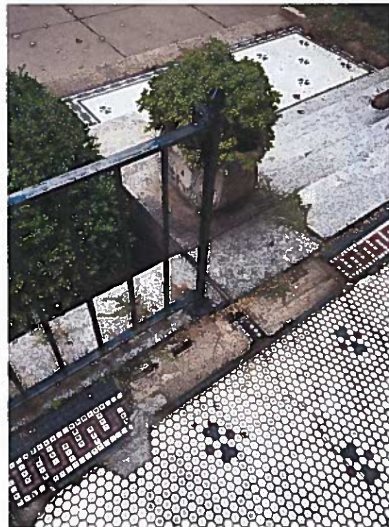
GHOSTING FROM ORIGINAL COLUMNS AT EXISTING TERRACE