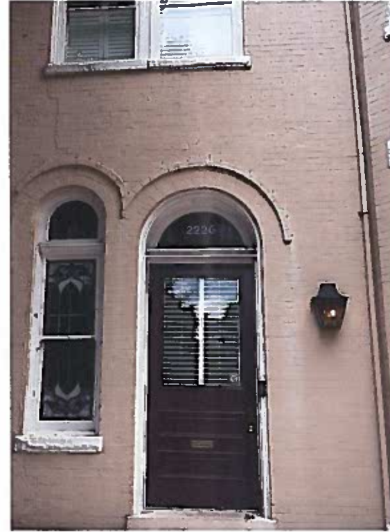
GHOSTING FROM ORIGINAL STRUCTURE AT EXTERIOR WALL