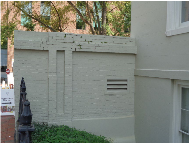
Figure 3. West side of the Steam Room, located on the northeast corner of the White House for the Confederacy.