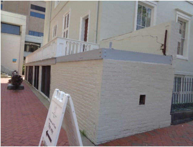
Figure 5. View of the east and north sides of the Steam Room, with the wall that will be removed and reconstructed on the west side.