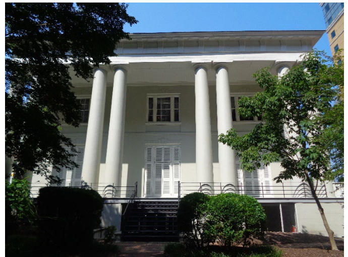
Figure 8. View of the south side of the White House of the Confederacy.