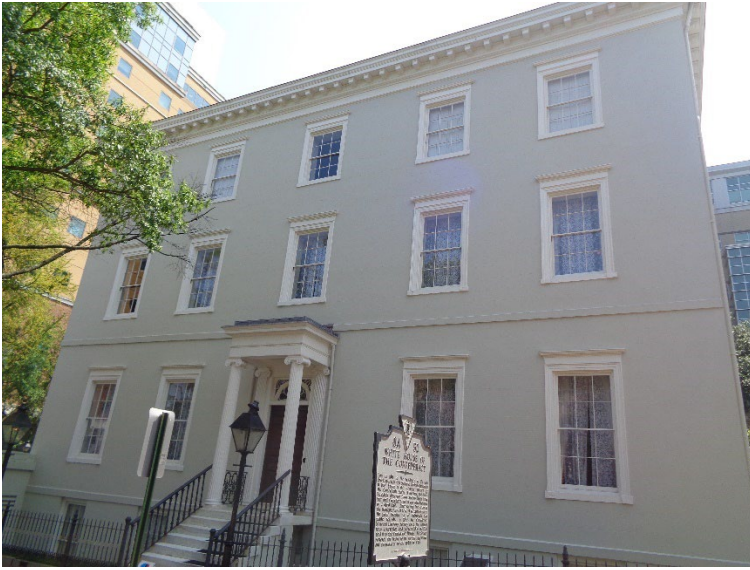
Figure 1. Façade, north side, of 1201 East Clay Street, the White House of the Confederacy.