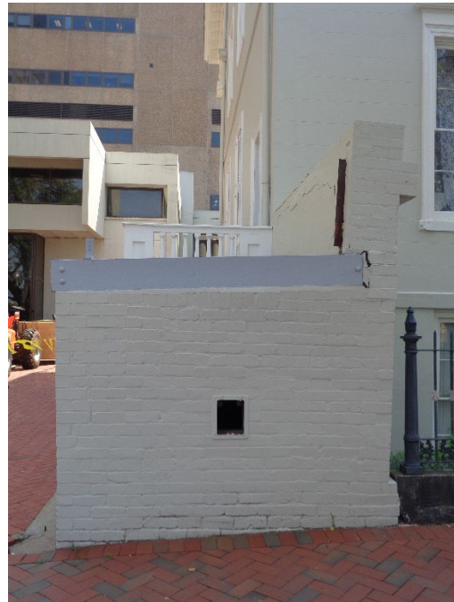
Figure 4. North side of the Steam Room on the northeast corner of the White House for the Confederacy. The wall that will be removed and reconstructed is on the west side, above the steam room.