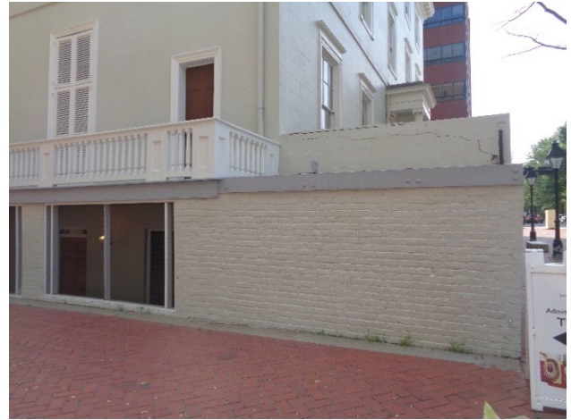
Figure 6. View of the east side of the Steam Room.