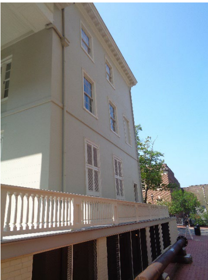
Figure 7. View of the east side of the White House of the Confederacy.