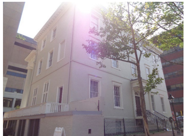
Figure 9. View of the north and east sides of the White House of the Confederacy. This photograph shows most of the historic windows on the building.