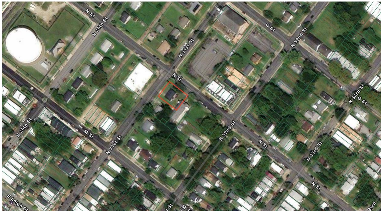
Figure 1: Existing lot pattern

The Property is located on the southeast corner of the intersection of N 31 st and N Streets. The Property is referenced by the City Assessor as tax parcel E000-0726/054, is approximately 80 feet wide by 88 feet deep and contains approximately 7,040 square feet of lot area. The Property is currently improved with a small single-family dwelling, constructed in 1981. Due to the configuration of lots in the block, no alley access is provided for the Property.