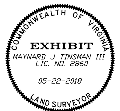
EXHIBIT MAP OF TWO PARCELS TOTALING 0.49 ACRES OF LAND SITUATED ON THE EAST SIDE OF NORTH BOULEVARD AND THE WEST SIDE OF MYERS STREET CITY OF RICHMOND, VIRGINIA